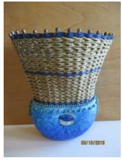
Shelia Guidry – "Blue Bayou"