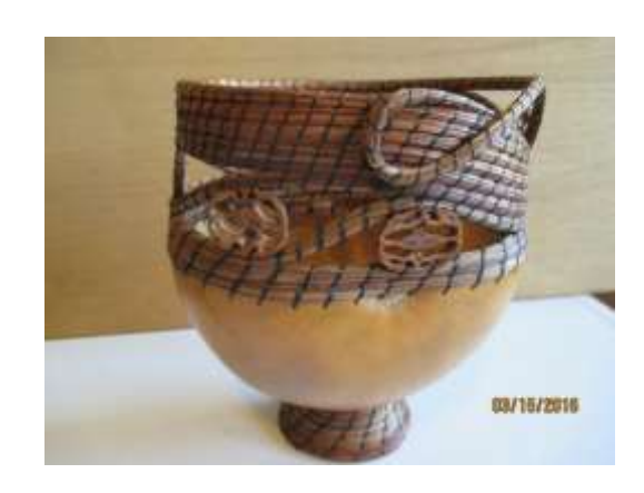
Vickie Hartman – "Step It Up With Black Walnuts"