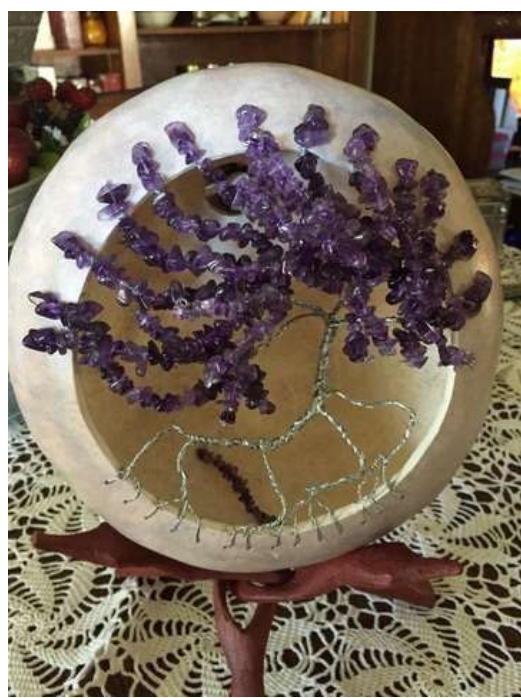
Vickie's Gem Tree