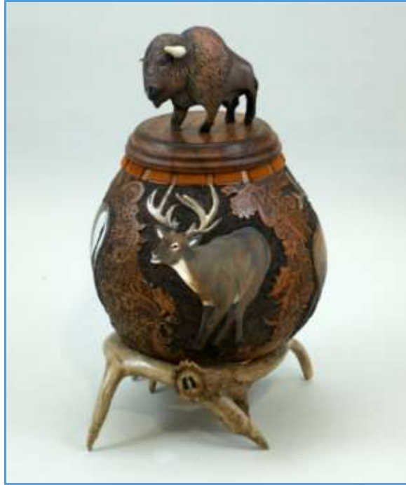
BEST OF SHOW Mike Munter