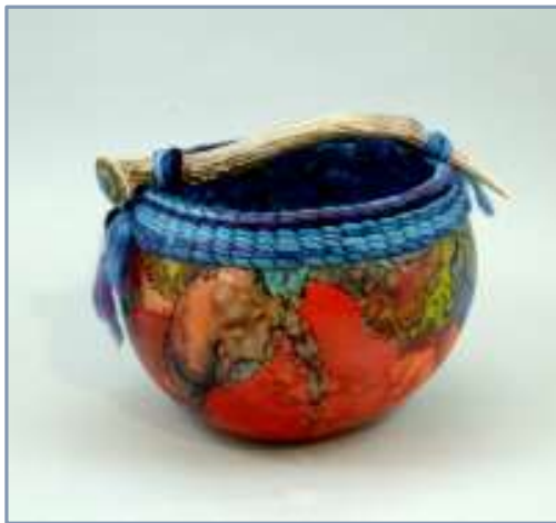
Vessels Zeldajean Byrd