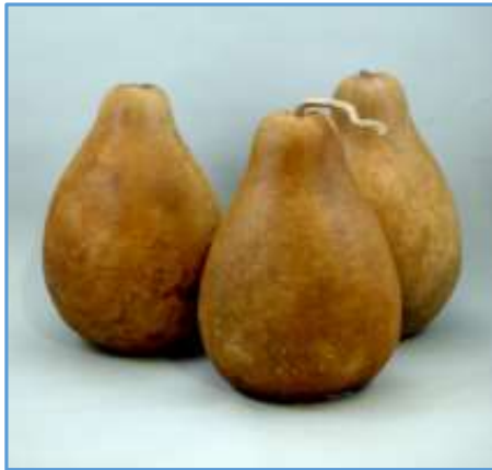
3 of a Kind Bill Schiel