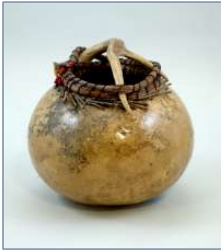
YOUTH DIVISION Noah Spinrath