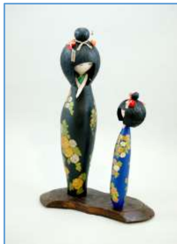
Doll Yoshi Green