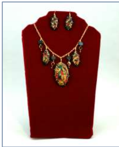
Wearable Linda Hughes