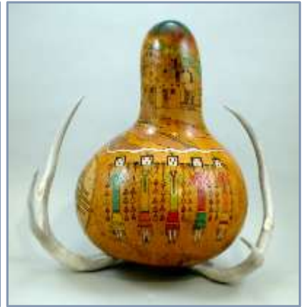
SW/Native American Becky Klix