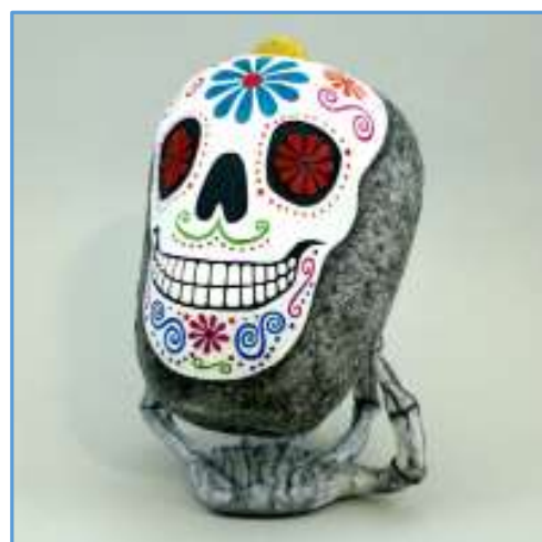
Holiday Becky Truex