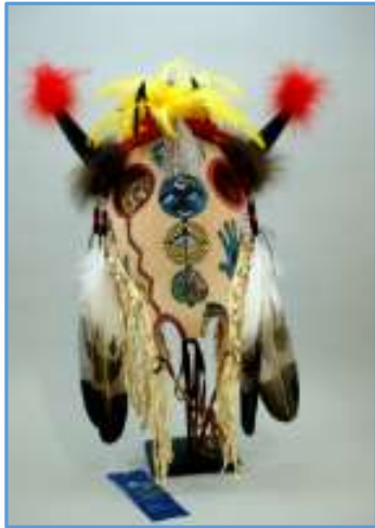
SW/Native American Cheryl Trotter