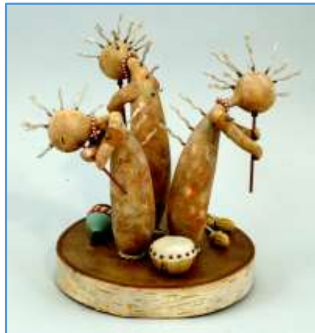
SW/Native American Clarissa Spence