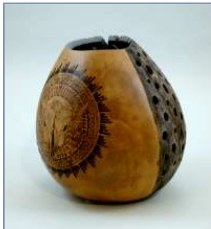
Pyrography Lynda Boltz