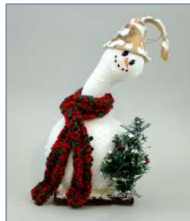
Holiday Nita Beard