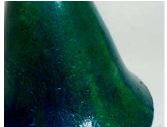
Color on gourd using Memories Mists in multiple colors.

The next BAG patch meeting will be October 17 when we will be experimenting with colored pencil on ornaments.