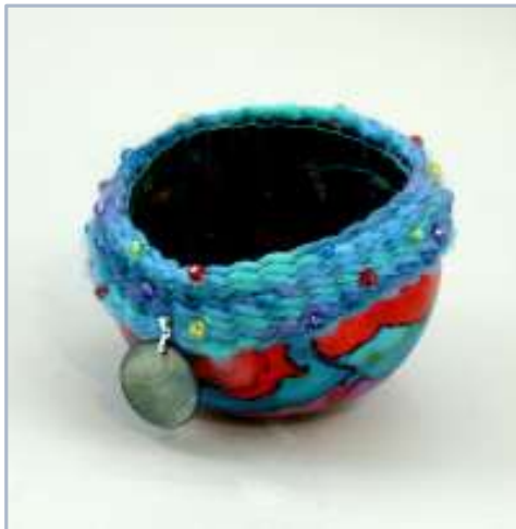
Vessels Nita Beard