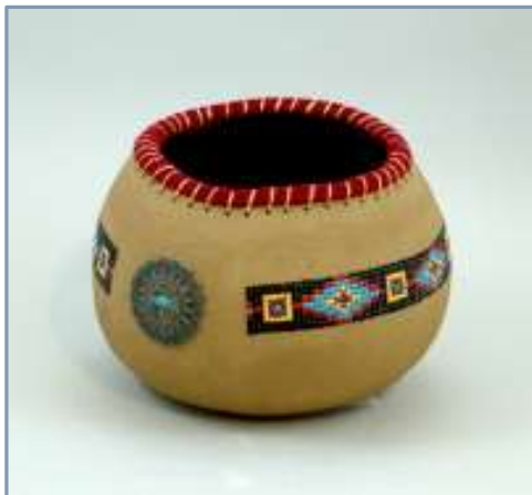
Southwest/Native American Lynda Boltz