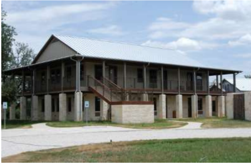
1 2 lodges with wrap-around porches with views of the Guadalupe River on 78 acres

Hellen Martin and Shelia Guidry have been working on the logistics for a gourd retreat with only classes and fun for TGS members (if you are not a TGS member yet you can still join TGS, then sign up for the retreat). The dates for the retreat are March 4, 5 and 6, 2016. We will have a very short Spring Business Meeting during supper on Saturday, March 5, 2016 during the retreat. The retreat will be held at Camp Capers which is off of I-10 (west of San Antonio) past Boerne and is an Episcopal Camp at 418 FM 1621, Waring, TX 78074.