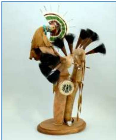
Sculpture Clarissa Spence