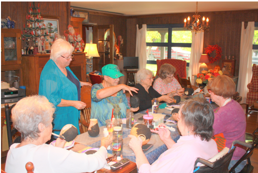
We worked on a nativity pattern one month using a silhouette pattern on a sunrise background.