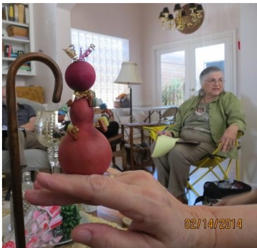
February Show n Tell