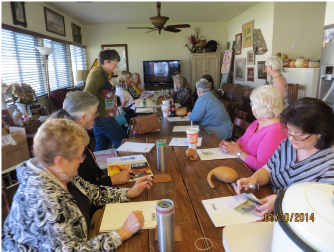
January Demonstration on Golden Products