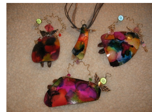
Class SU-4A $50 8 AM – 12 Noon Gouradian Angels Mari Tarver Skill level-All