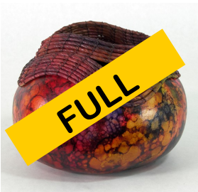
Class SA-1A $55 8 AM – 12 Noon Alcohol Dye Technique Judie Richie Skill level - All