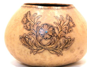
Class F – 4A $50 8 AM – 12 Noon Faux Leather Tooling Pyrography Hellen Martin