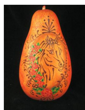
Class T-1P $50 1 pm – 5 pm Run For The Roses Miriam Joy Skill Level - All