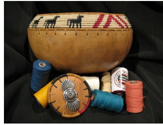
Class F – 7A $50 8 AM – 12 Noon Basic Closed Coiling Darla Hines Skill level - All