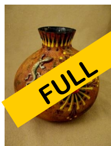
Class F – 1P $50 1 PM – 5 PM Basking in the Sun Miriam Joy Skill level - All