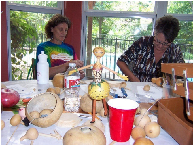
Members of the Capital of Texas Gourd Patch