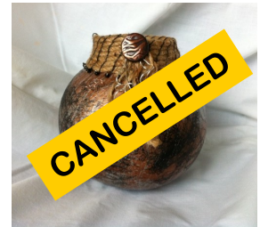
Class F – 8P $50 1 PM – 5 PM Textured Metallic Gourd w/Coiling and Embellishment Margaret Bell Skill level - Beginners