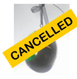
Class SA-4P $50 1 PM—5 PM Gourd Egg Ornament Susan Urban Skill-Beginners