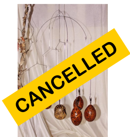
Class SU-1A $55 9 AM – 3 PM Zenmobile Clara Willibey Skill level - All