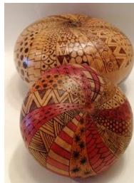
Class SA-3P $65 1 PM – 5 PM Pyro Patterns Barbie Holton Skill level - All