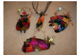
Class SA-5P $50 1 PM – 5 PM Gouradian Angels Mari Tarver Skill level - Beginners