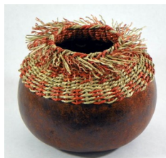
Class SU-2A $60 8 AM – 12 Noon Twining w/Seagrass Judie Richie Skill level - All