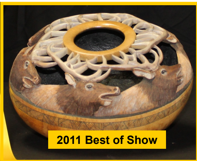
2011 Best of Show

Gillespie County Fairgrounds Fredericksburg, TX