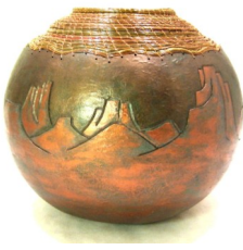
Class F – 5P $65 1 PM – 5 PM Southwest Mountains Hellen Martin Skill level - All