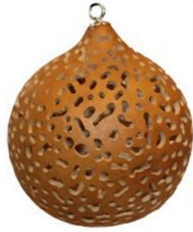
Class F – 6A 9 AM – 12 Noon $60 Filagree Ornaments Barbara Longanecker Skill level - All