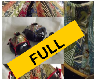
Class SA-1P $35 1 PM -4 PM Asian Bowl w/Washi Paper Collage Terry Noxel