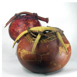
Class F– 2A $65 8 AM – 2 PM Coiling with Antler Judie Richie Skill level - All