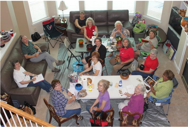
Southwest Gourd Patch Members