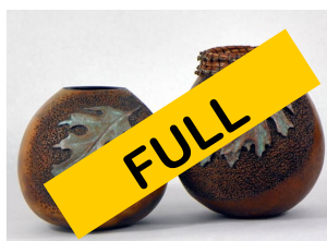
Class T – 2A $75 8 AM – 2 PM Copper Leaf-Relief Carving Judie Richie Skill level - All