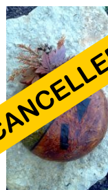
Class F-3P $65 12:30 PM – 4:30 PM Leather Texture Sue Haberer Skill level - All