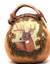
Class T – 4A $100 8 AM – 4 PM Deer Pyrography & Colored Pencil Hellen Martin Skill level - All