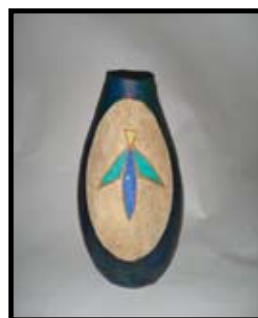
Sat. Oct. 15 1-5pm $70 Inlay & Carving Without Sanding Barbie Holton All levels