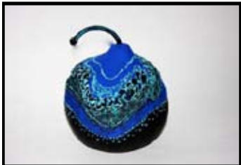
Thurs. Oct. 13 11-4pm $70 Texture Without Carving Barbie Holton All Levels