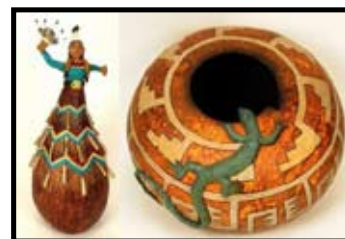
Sat. Oct. 15 1-5pm $55 Air Dry Clay Bonnie Gibson Skill level - All