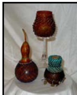
Sat. Oct. 15 8-12noon $30 Beaded Knotless Netting Clara Willibey All levels