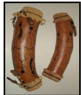
Thurs. Oct. 13 11-4pm $55 Gourd Rain Stick Cass Iverson Skill level - All