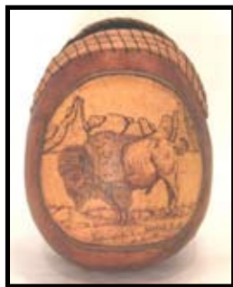
Fri. Oct. 14 1-5pm $55 Buffalo in SW Setting Hellen Martin Skill level - All