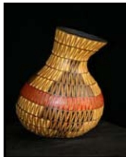
Thurs. Oct. 13 9-4pm $55 Navajo Basket Miriam Joy Skill level - All