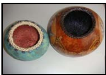
Sun. Oct. 16 11-2pm $55 Round Braid Pamela Gilde Skill level - All

PLEASE NOTE: The deadline for pre-show registration for classes is October 1st! Also, classes not meeting their minimum by Sept. 15th will be cancelled. So, please make your registrations as early as possible to get the classes that you want. There may be classes available for walk-ins at the show, if space is available.