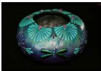
Fri. Oct. 14 1-5pm $45 Emerald Dragonfly Miriam Joy Skill level - All