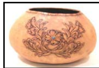
Sat. Oct. 15 8-12 noon $55 Western Tooling Hellen Martin Skill level - All