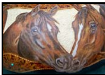
Fri. Oct. 14 9-4pm $65 Colored Pencil Application on a Gourd Sylvia Gaines All levels