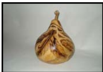
Fri. Oct. 14 1-5pm $60 Pyro Feathers Barbie Holton Skill level - All