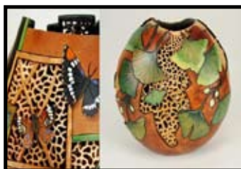
Sat. Oct. 15 8-12 noon $50 Filligree Carving Bonnie Gibson Skill level - All