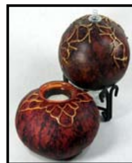
Sun. Oct. 16 8:30-12:30 $65 Gilded Lamp Judy Richie Skill level - All