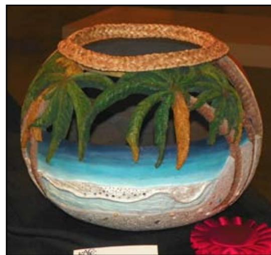
Carving – 2nd Place, Cheryl Trotter