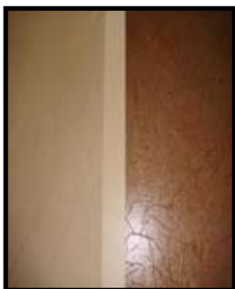
Thurs. Oct. 13 11-4 pm $65 Faux Finish Pamela Gilde Skill level - All