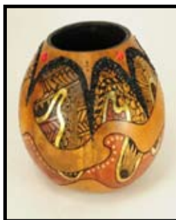
Fri. Oct. 14 9-4pm $70 Doodles & Glass Bonnie Gibson Skill level - All