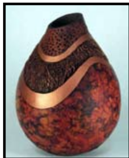
Thurs. Oct. 13 9-2pm $75 Crafty Cactus Judy Richie Skill level - All