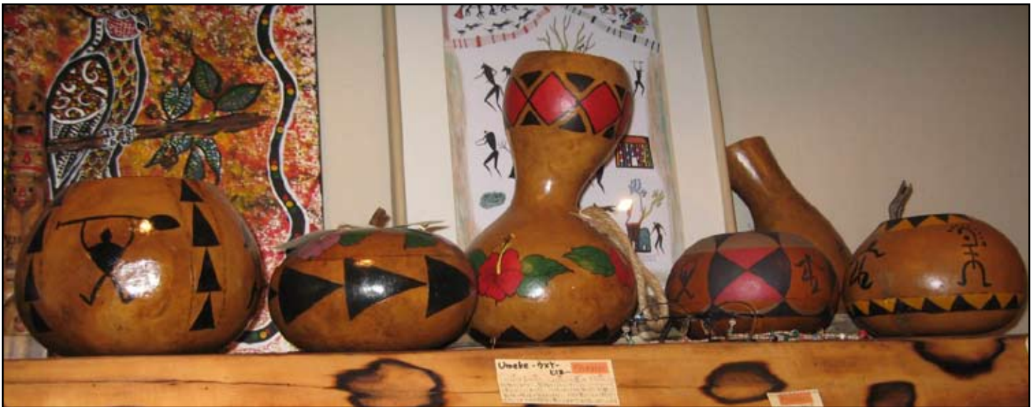
Some examples of the style and type of gourds for sale at Middles - Craft Shop.

My relatives from Japan got a lesson on gourds from me and will be keeping an eye out for them from now on. I told them all about the Texas Gourd Society and American Gourd Society but could not find a Japanese Gourd Society.