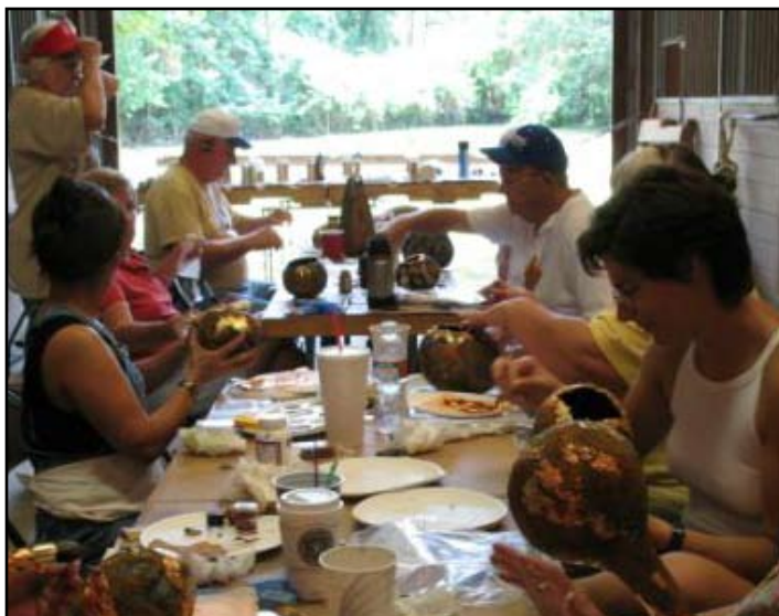
Patch members participating in one of their monthly workshops.