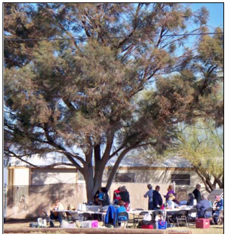
A class in session outside under a magnificent tree – perfect weather, perfect day!