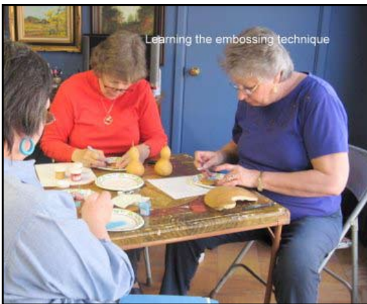
Members of the West Texas Patch learn the embossing technique.