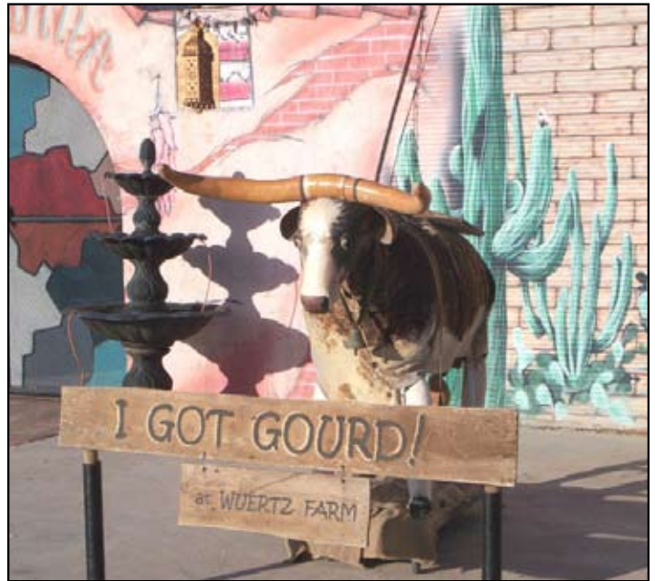
A unique sculpture created almost entirely out of gourds announces "I Got Gourd!" in front of one of the buildings on the fairgrounds.