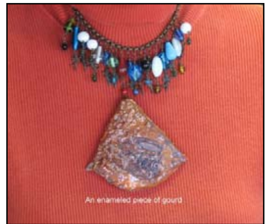
An example of a necklace created with an enameled gourd shard.

TGS EAST TEXAS PINEY WOODS GOURD PATCH- East TX area CONTACT: Pam Word havnwords@peoplepc.com 903 663-0017 Piney Woods web site http://www.geocities.com/pwgourds/patch.html