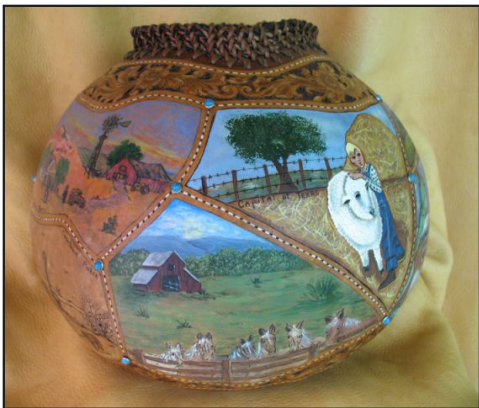
West Texas Patch, East Texas/Piney Woods Patch and Capital of Texas Patch.