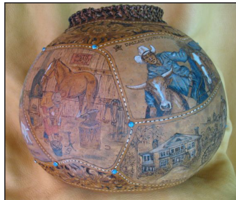
SE Gourd Patch, Dallas Gourd Patch and Arlington Gourd Patch.