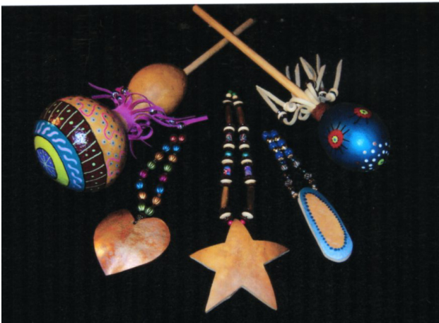
A sample of shapes, items and supplies available for children to create a keepsake with.