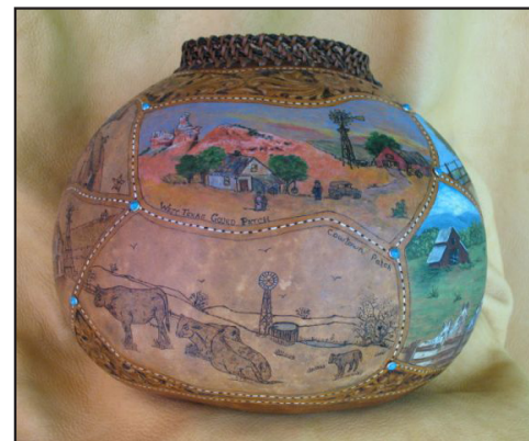
West Texas Patch and Cowtown Patch.