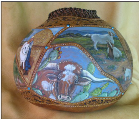
Far West Texas Patch and Guadalupe Patch.