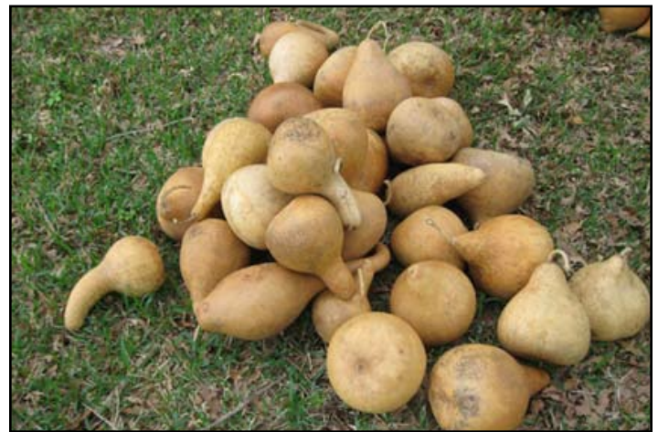
A pile of donated kettle and penguin gourds delivered to the Ft. Worth Zoo.