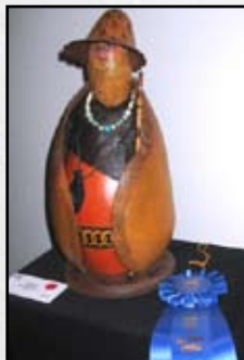
1st Place Sculpture Bill Decker