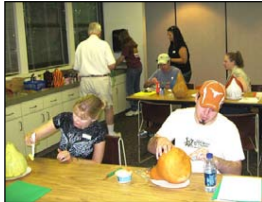
Volunteers practice painting their own gourd houses.

I hope that this will be the start of a successful and long collaboration between the Fort Worth Zoo and the Texas Gourd Society.