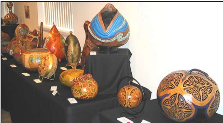
A table with a variety of gourd art created by artists at the Southwest Gourd Art Show.

Thanks! KACC for supporting gourd artists.