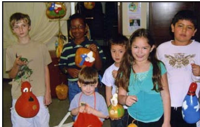
Children from Jonathans Place show off their finished gourd bird houses.