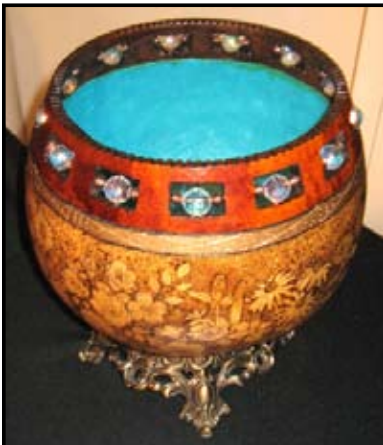
Lelia Sublett's beautiful creation "Flowers and Crystals."

Thanks! KACC for supporting gourd artists.