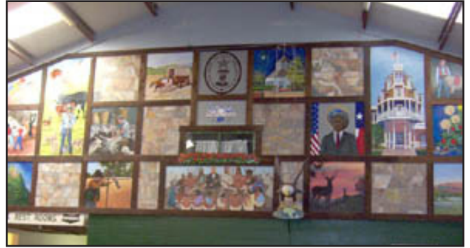
A lovely mural is painted on the front wall of the Exhibition Hall which will beautifully accent our gourd event.

Our Fall Banquet and Business Meeting during the Festival will be held on Saturday evening following the first show day, Oct. 18th. Competition judging will be held on Friday evening after entry drop off. During the banquet the 2009 Artist of the Year will be announced along with the People's Choice Award. Everyone should be looking forward to that!