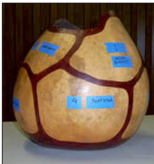
2008 TGS Raffle Gourd – Wildflowers of Texas