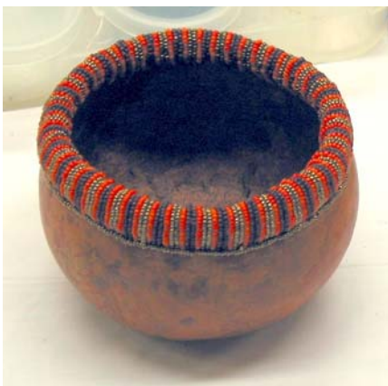
Dusti Lockey Bead Edge Demo