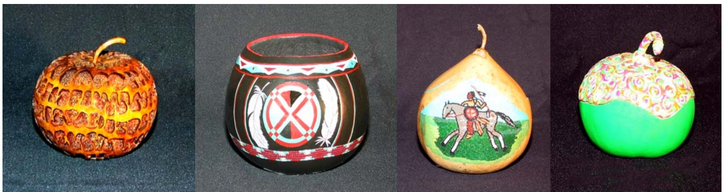
Div 1 - Marsha Mefferd -- Carved, Cut, etc.