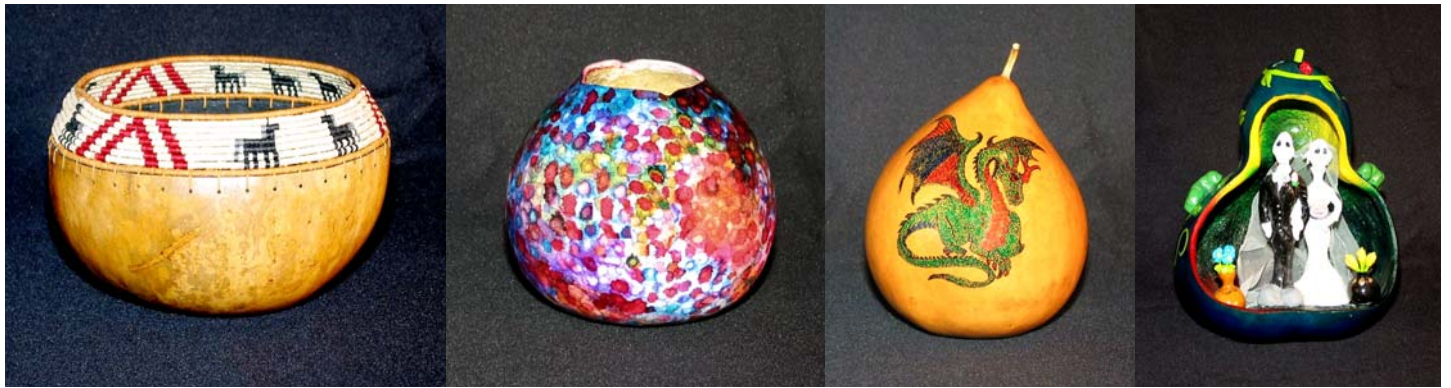
Div 1 – Darla Hines – Weaving, Coiling, etc.