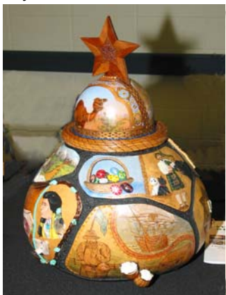
TGS Travel Raffle Gourd