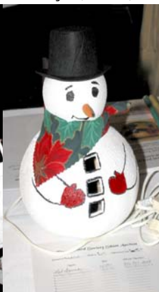
Silent Auction on Fri