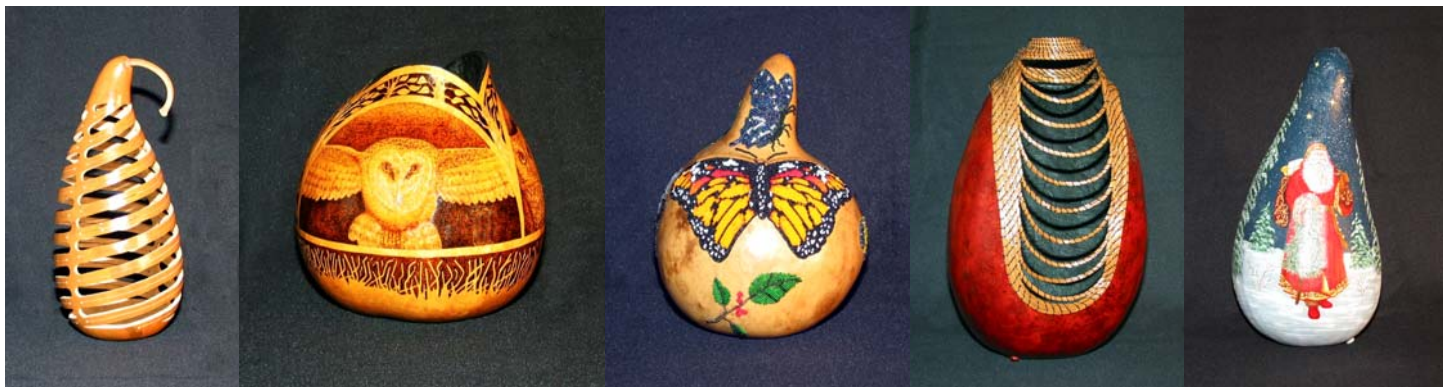
Div 2–Bert Petrie–Carved