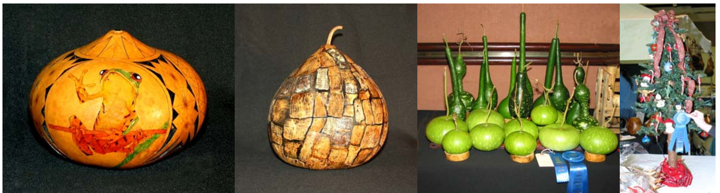
Best of Div 2 -- Bert Petri -- Mixed Media