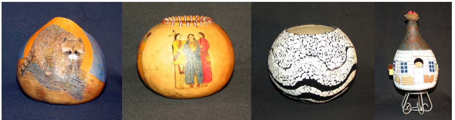
Div 2 – Bill Decker – Ink/Colored Pencil