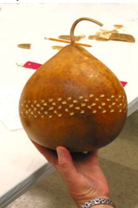
E. Endicott Chipping Class