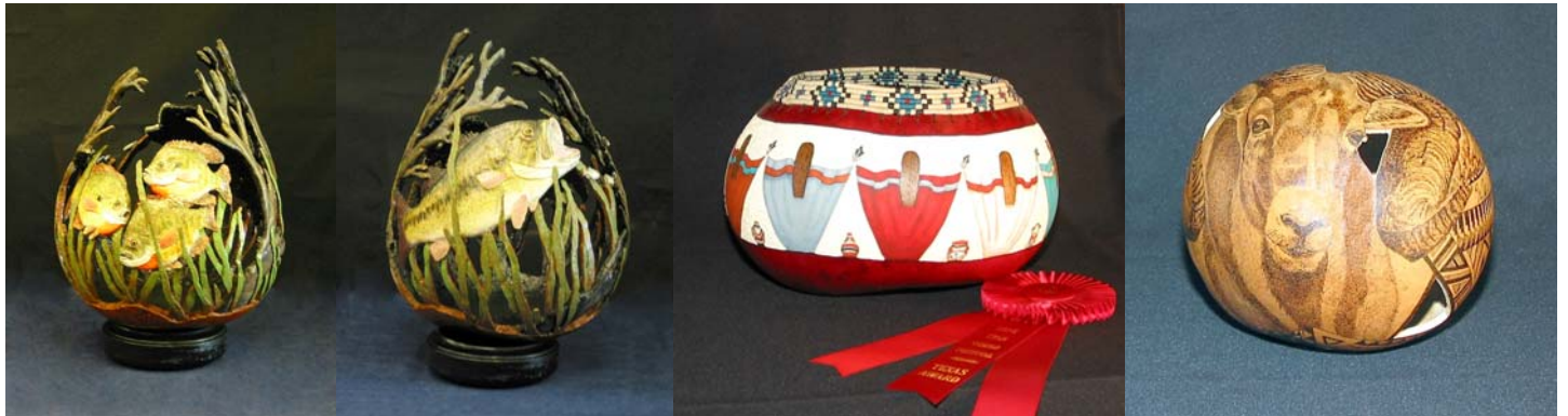
Don Vyskocil--Best of Show A --Best of Show B -- Mixed Media