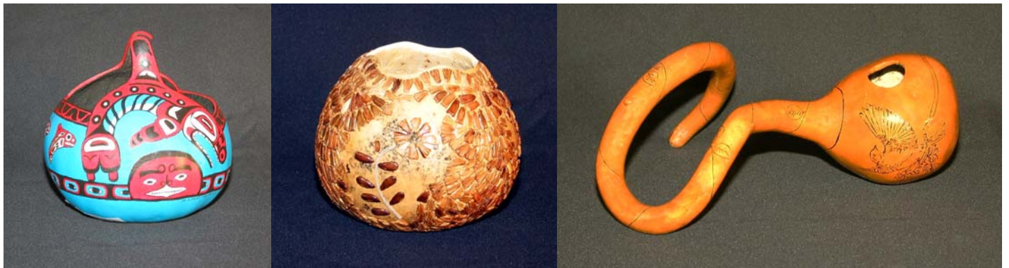
Div 1 Sylvia Gaines – Native American Style