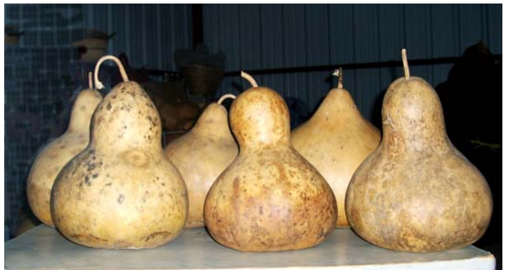
Above - Bottles and Kettles