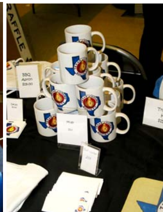
TGS Café Press