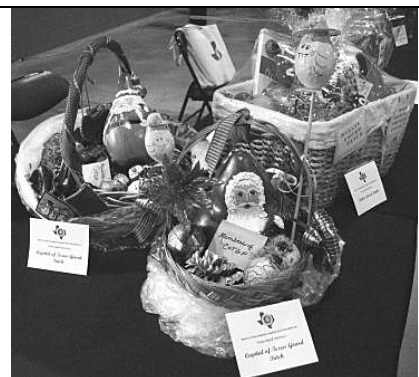
Capital of Texas 3 baskets