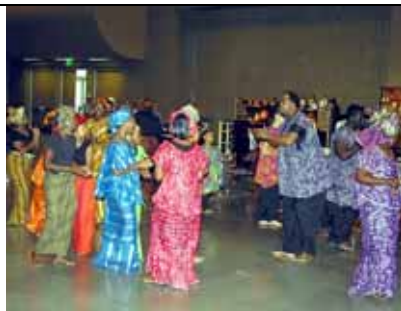
Cultural Dance & Drum Ensemble & Mwendo Rythmic Spirit Group