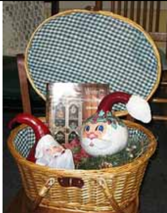
Arlington Raffle Basket