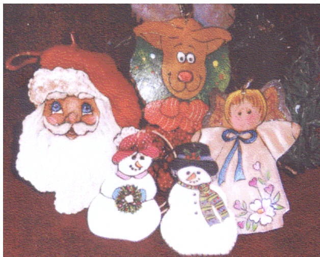
These ornaments were created on flat cut gourd pieces.

Lelia has generously offered her version of the Gourdian Angel pattern and instructions to be printed here. She says this was originally a pattern purchased at a woodworkers show; she adapted the pattern to be transferred to a cut gourd piece (see Gourdian Angel on the right in the photo below).