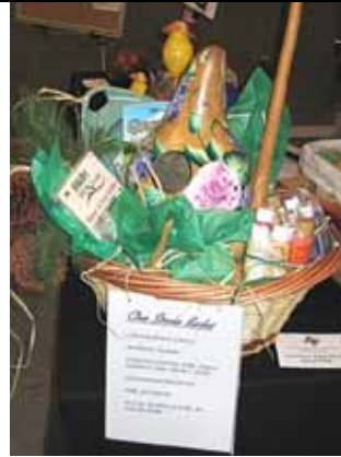
East Piney Woods Basket