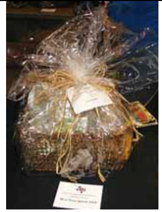
West Texas Basket