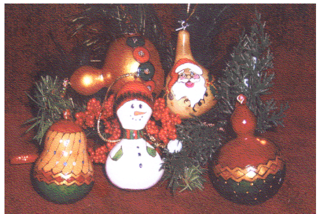
These ornaments were created on whole gourds; the masking-tape technique was used for some image transfers.