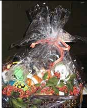
Heart of Texas Basket