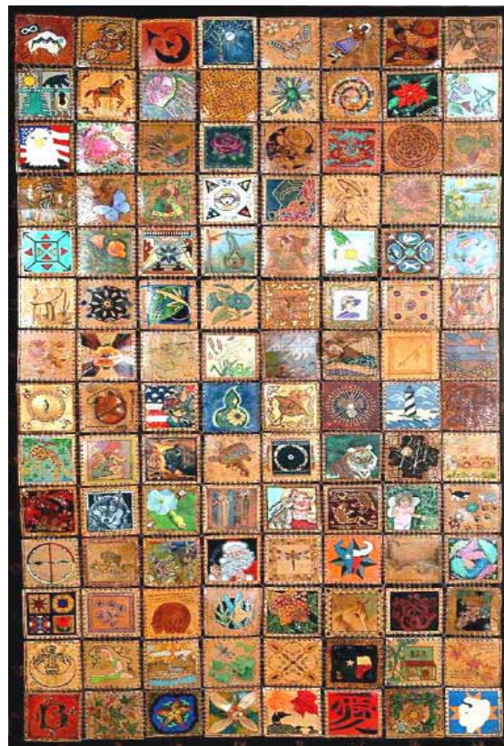
The "Gourd Quilt" by 112 Artists at the Fall Show