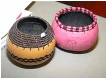
Linen Coil Rim Class By Betty Brunswick