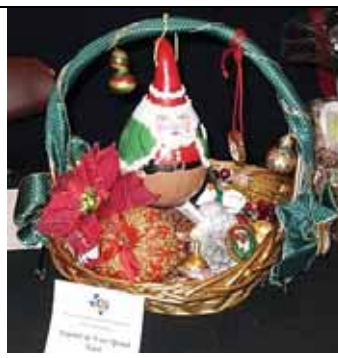
Capital of Texas Basket