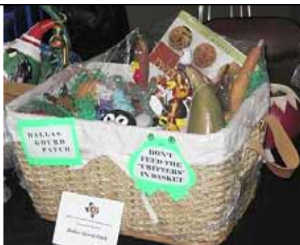
Dallas Raffle Basket