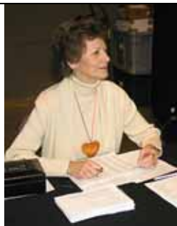
Ethel Virgin Membership