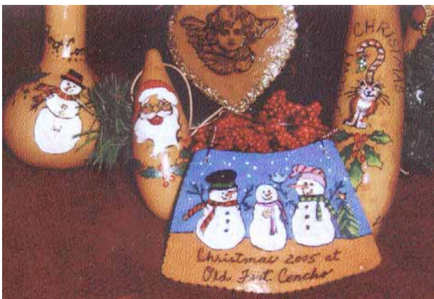
The images on these gourds are rubber-stamped; extra details were added free-hand.