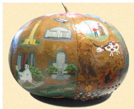
Texas Traveling Gourd

ADMISSION Adults $3.00, Students w/ ID & Senior Citizens, $ 2.00 Children under 12, FREE