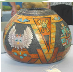
Best of Show, 2004 Judy Richie

New Location Now 2 Days Bigger!! Better!!