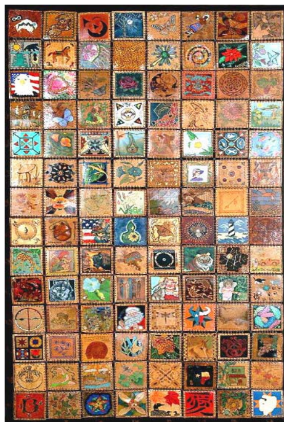
See the "Gourd Quilt" by 112 Artists at the Fall Show