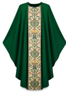
Green, Gothic – $650