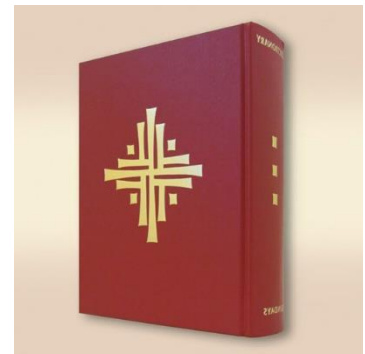
Sunday Lectionary - $ 100