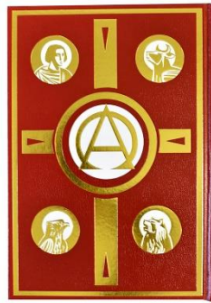
Gospel Book - $ 199