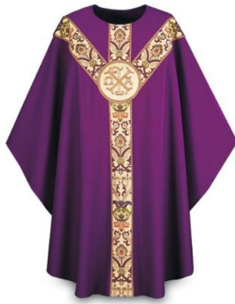
Purple, Gothic – $925