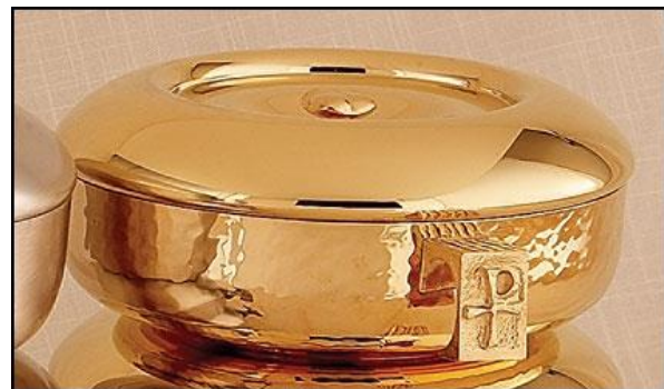
Ciboria 3 Nos. $484 each