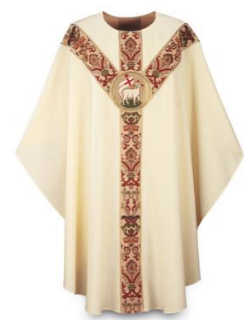
White, Gothic - $925