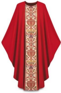
Red, Gothic- $650