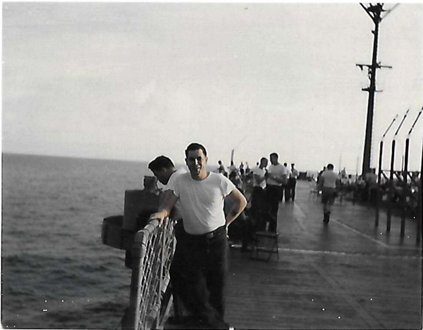
Me standing on deck during a cookout.