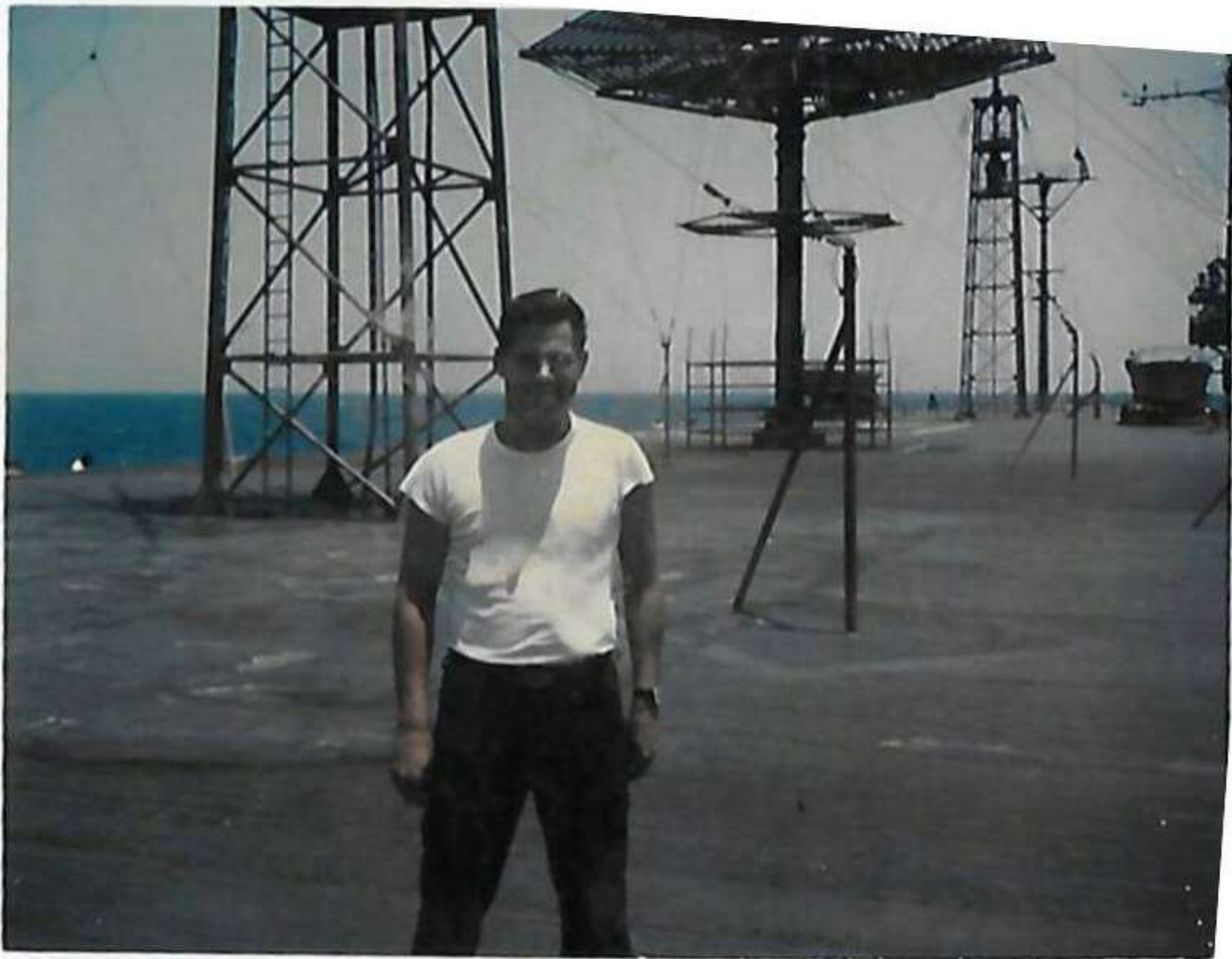
Me on the Antenna Deck.