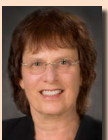
Francine Shapiro, PhD

In EMDR clinical practice, it is expected that single-trauma victims can be efficiently treated consistent with RCT reporting 84-90% remission of PTSD after 4.5 hours of treatment (Rothbaum, 1998; Wilson, Becker & Tinker, 1997) and 100% remission with a mean of 5.4 hours (Marcus, Marquis & Sakai, 2004). While the latter study also found a 77% remission of PTSD in multiple-trauma victims within the same timeframe, in clinical practice the treatment time for this population is generally expected to depend on several factors including: (a) the amount of preparation needed (e.g., if severely emotionally dysregulated), (b) the number of different "clusters" of adverse life experiences that must be addressed, and (c) the level of debilitation and skill deficit remediation required,