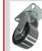
8" x 3" Forged Steel Swivel Caster