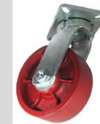
8" x 3" Ductile Steel Swivel Caster