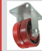
8" x 3" Ductile Steel Rigid Caster