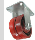
6" x 3" Ductile Steel Rigid Caster