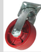
6" x 3" Ductile Steel Swivel Caster