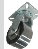
6" x 3" Forged Steel Swivel Caster