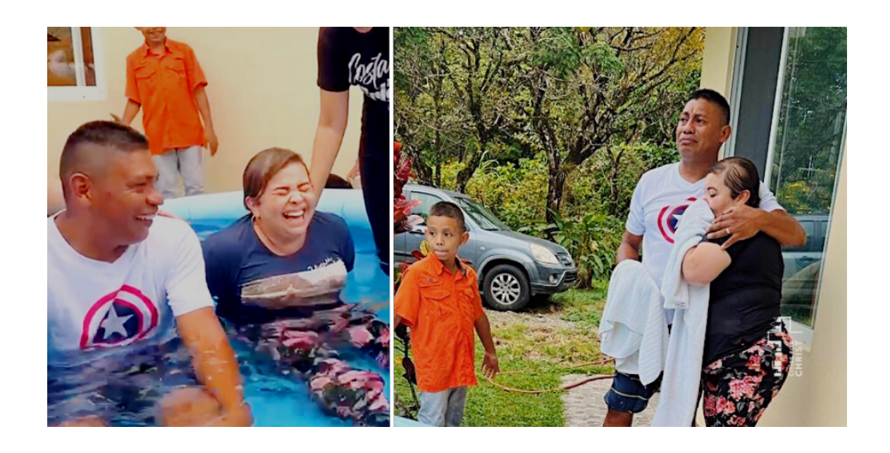
Panama - Testimony An entire Family Restored!

This past month we baptized a couple that not long ago were on the verge of divorce. Their children were the first to attend our services and an accelerated work of growth started in their lives. They shared with us the struggles they were facing at home and we encouraged them and told them that no situation was too big for God and together we prayed for their parents.