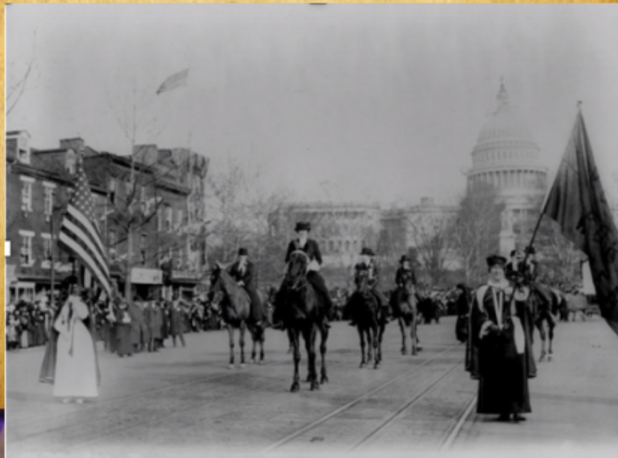
The head of the suffragist parade in Washington, 1913.