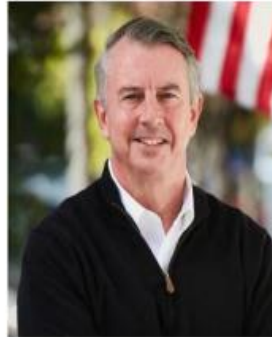
with Special Guest Ed Gillespie

Thursday, June 20, 2019, 6:00pm 7831 Kent Road, Alexandria, VA RSVP to campaign@votedj.com