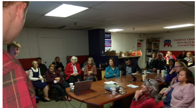
Above, left to right: