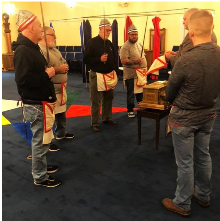
Conferral of the Royal Arch Degree, January 22, 2020.