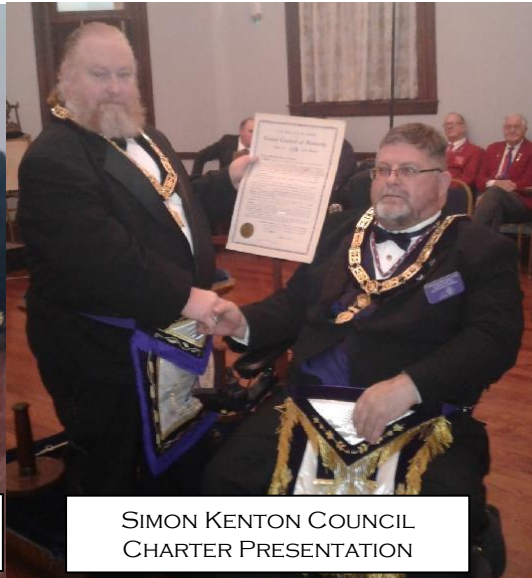
SIMON KENTON COUNCIL CHARTER PRESENTATION