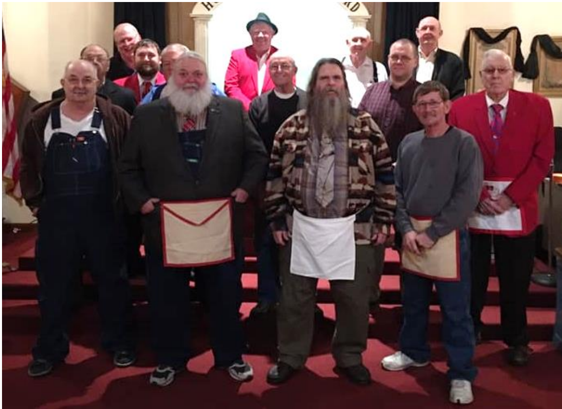
Lindsay Chapter No. 69 (Mayfield) – January 13, 2020 Conferral of Most Excellent Master Degree.