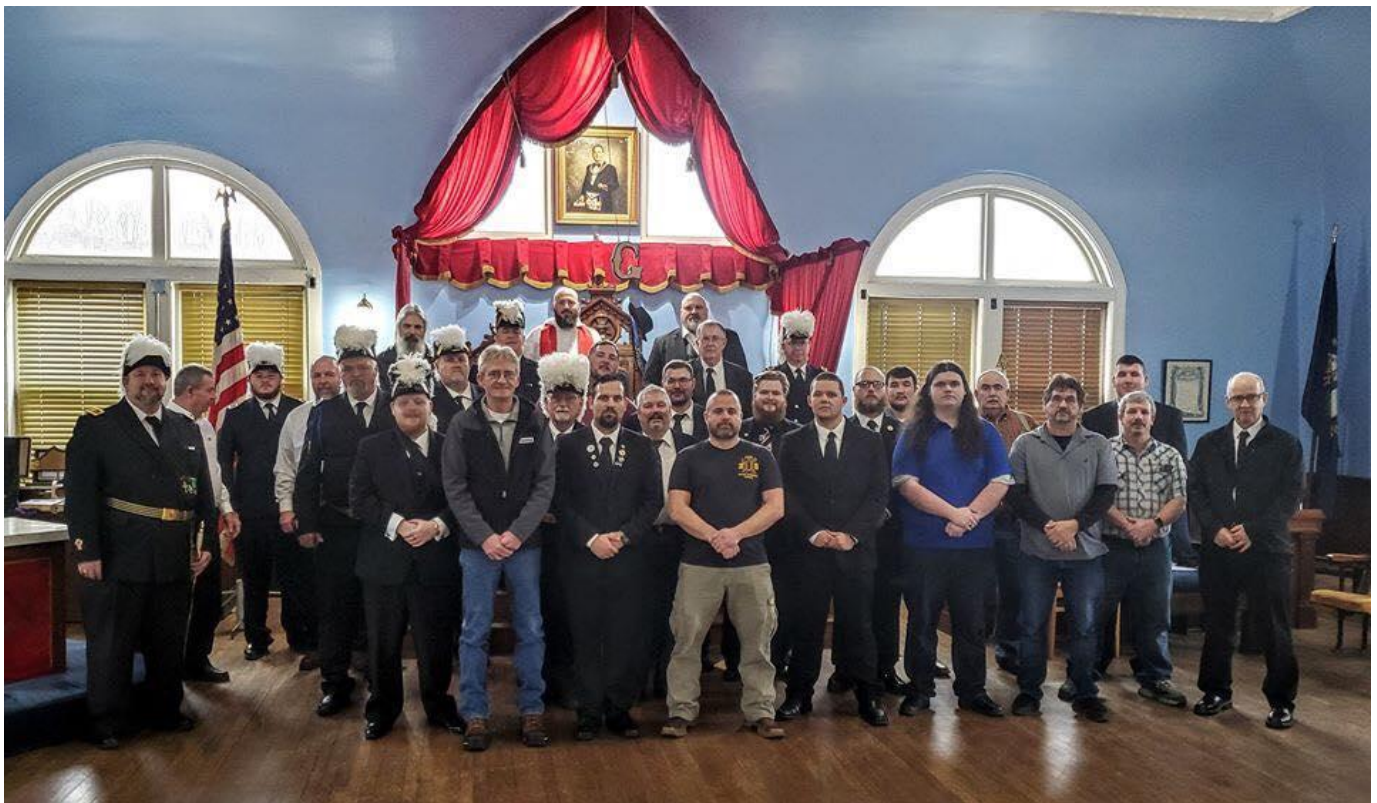
Commandery Orders – February 1, 2020 Congratulations to the 12 new Knights

Congratulations to new Companions/Sir Knights and to Paintsville on another successful Festival.