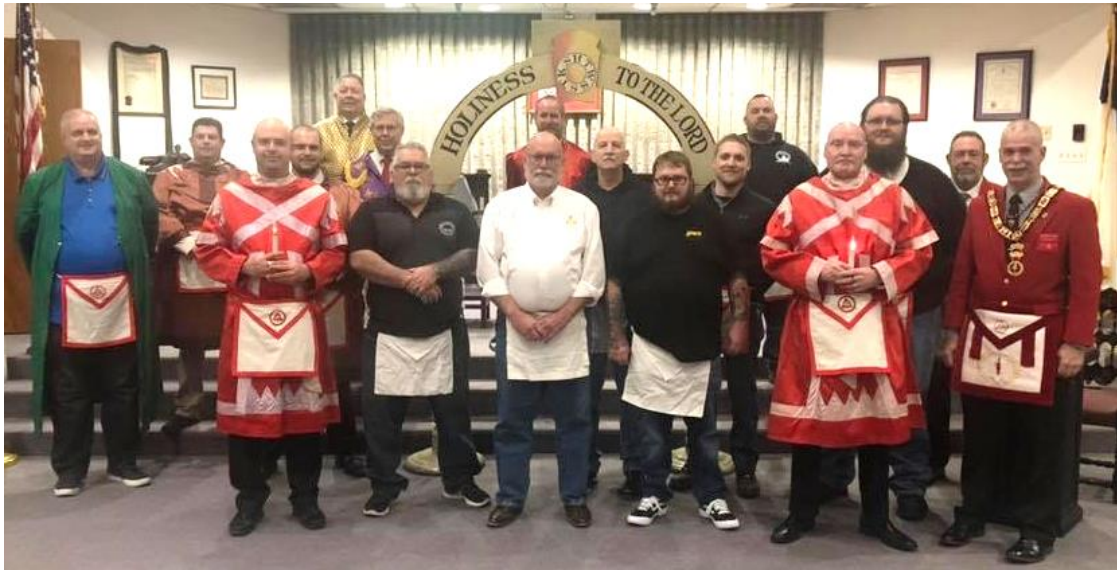
Conferral of Past and Most Excellent Master Degrees, January 15, 2020