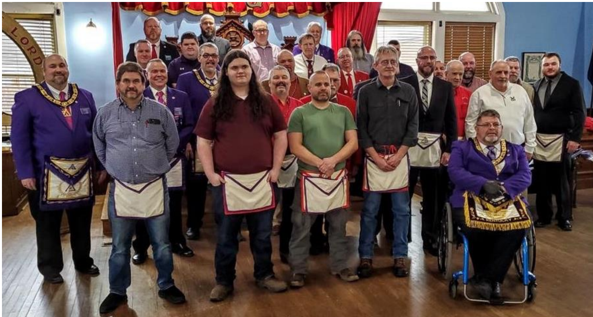
Chapter/Council Degrees – January 18, 2020