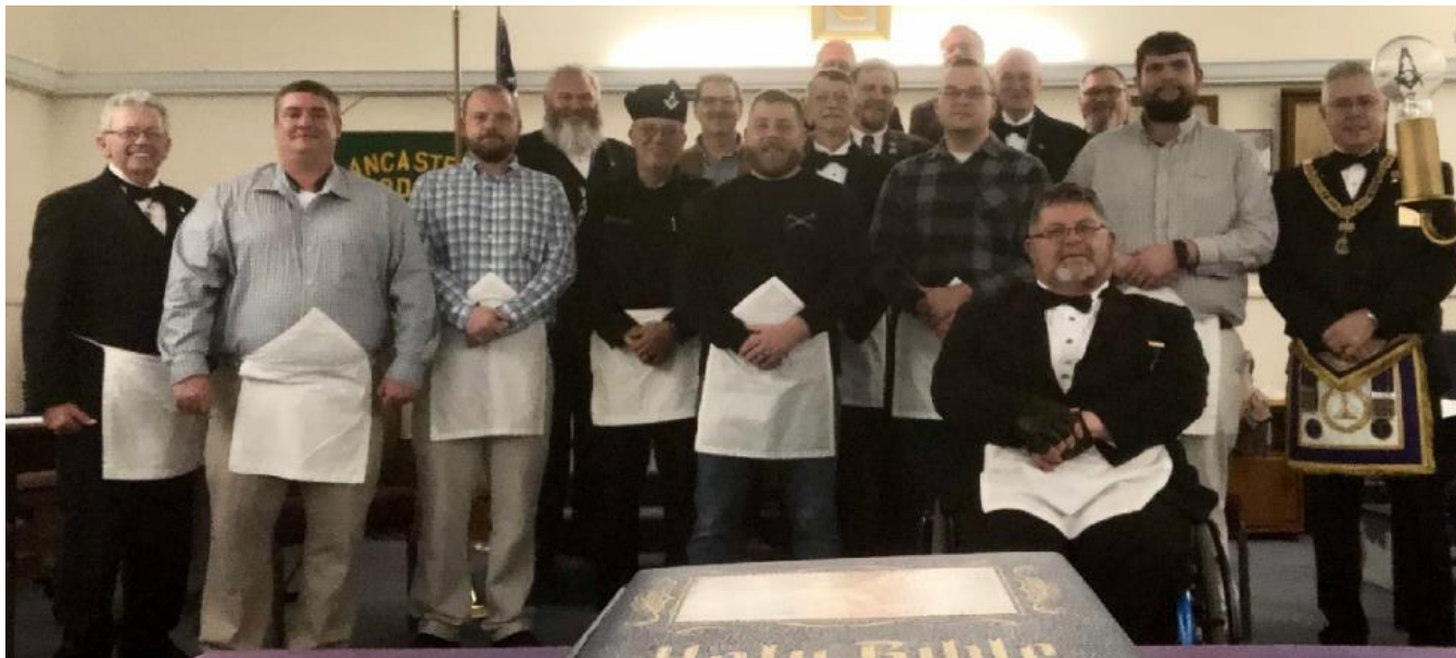
Blue Grass York Rite College No. 104 conferral of the Entered Apprentice Degree at Lancaster Lodge.