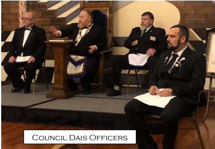
COUNCIL DAIS OFFICERS