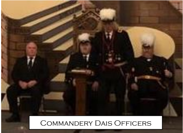
COMMANDERY DAIS OFFICERS