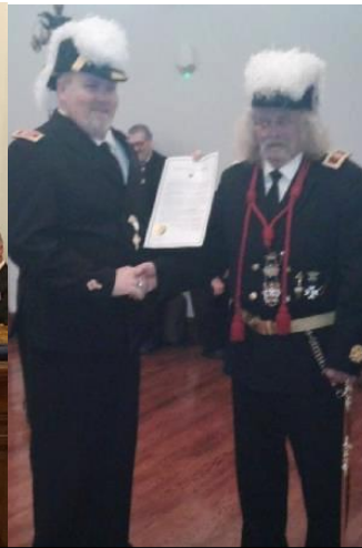
LIMESTONE COMMANDERY CHARTER PRESENTATION