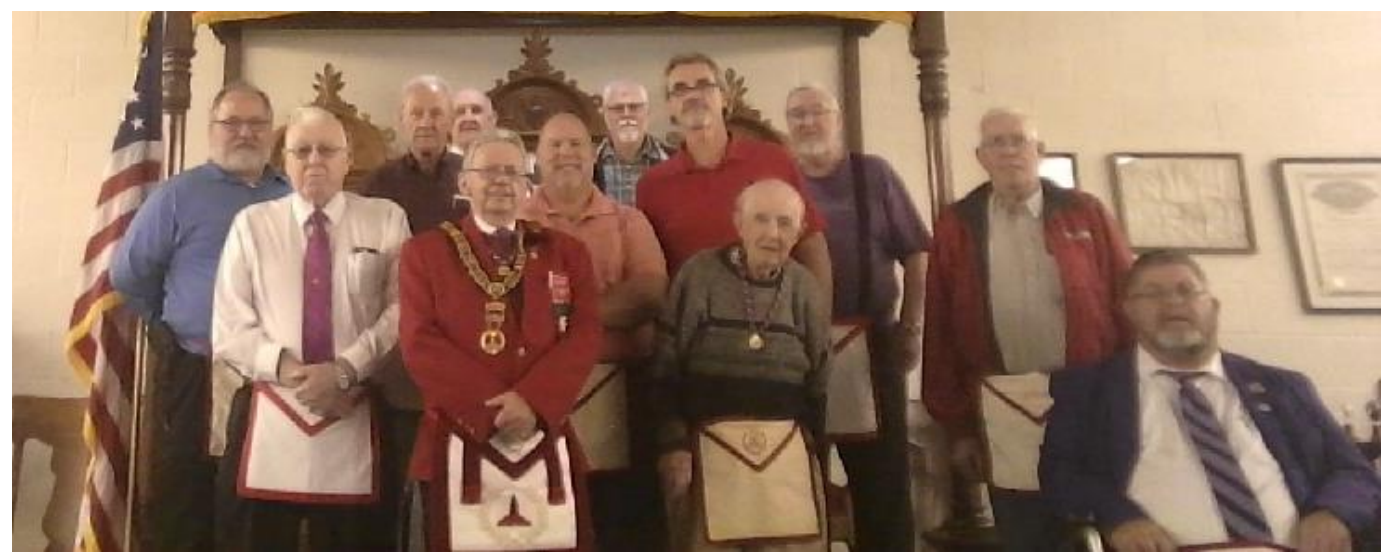
Chapter meeting in Russellville, November 19.