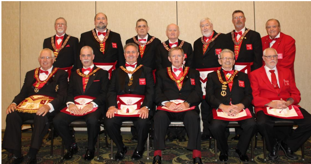
The Grand Chapter of Kentucky, Royal Arch Masons 2019-2020