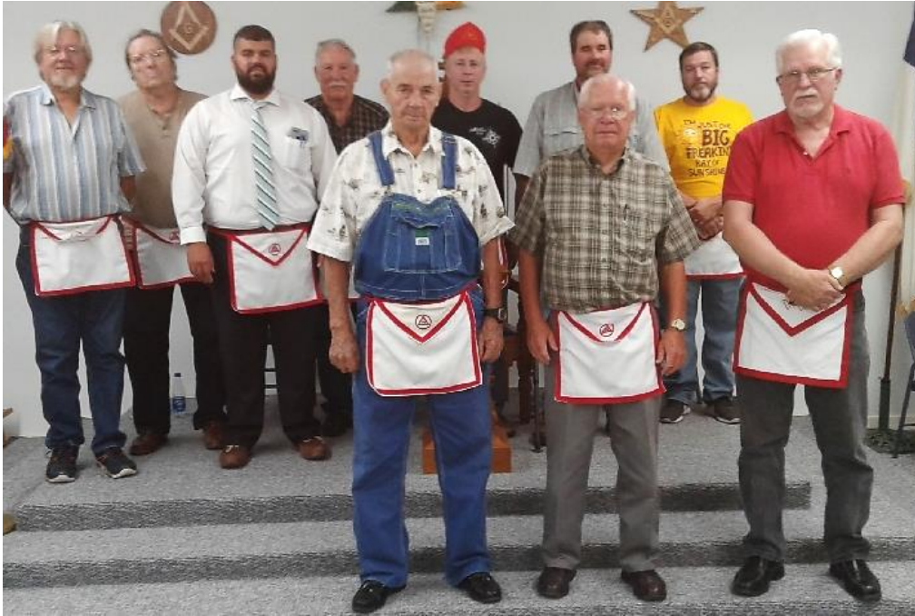
Chapter Work at Monticello, September 23, 2019.