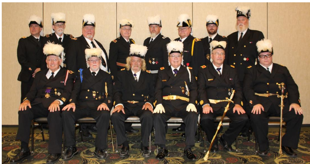
The Grand Commandery of Knights Templar of Kentucky 2019-2020