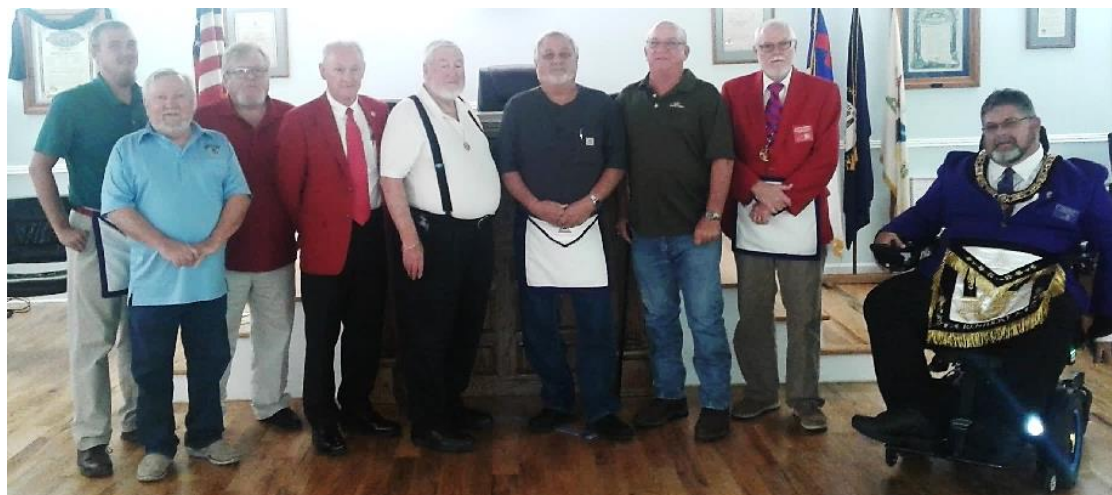
Scottsville Chapter and Council meeting, September 24, 2019.