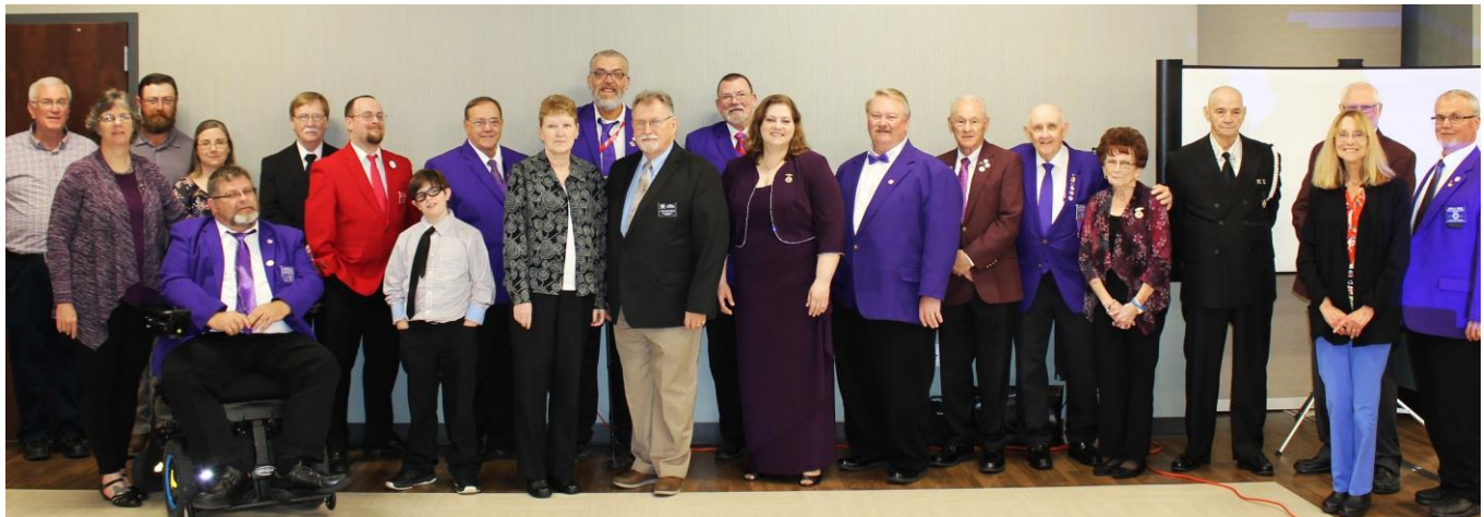
Thanks to all who came, and all who gave to support this worthwhile cause