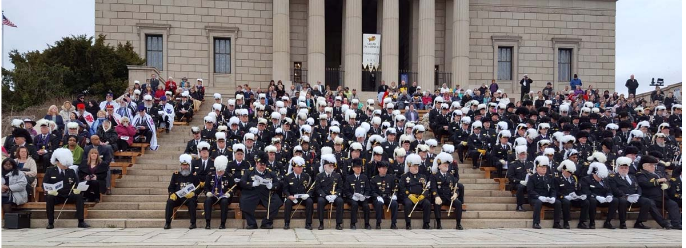
2018 Grand Encampment Easter Sunrise Service, George Washington National Masonic Memorial