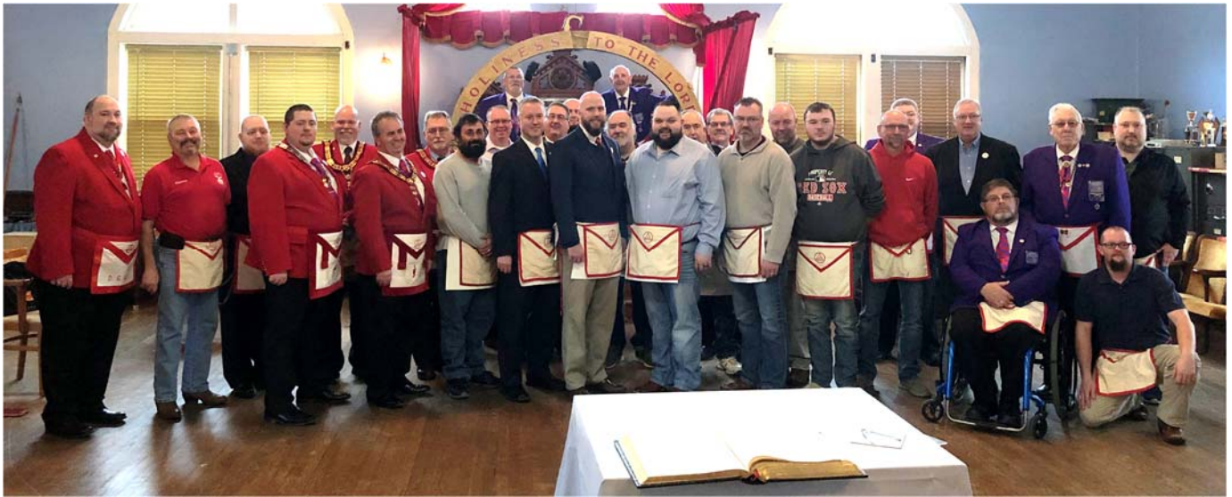
Congratulations to the candidates and cast from the 5 th Annual Paintsville Winter Festival