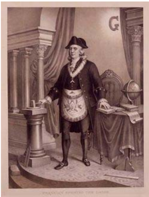
Franklin Opening the Lodge

February marks the birth of George Washington (1732-1799), our first president and arguably the best-known American Freemason. Benjamin Franklin (1706-1790), whose accomplishments are not as celebrated today, may have had more impact on the fraternity, and was perhaps equally important to the survival of our nation as Ambassador to France during the war.