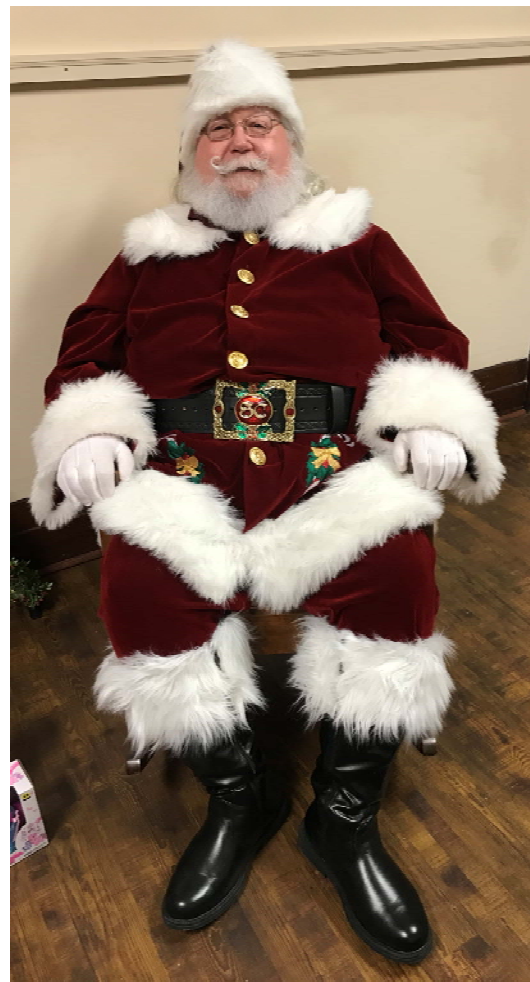
Santa put in an appearance at the Williamsburg Commandery Christmas observance.