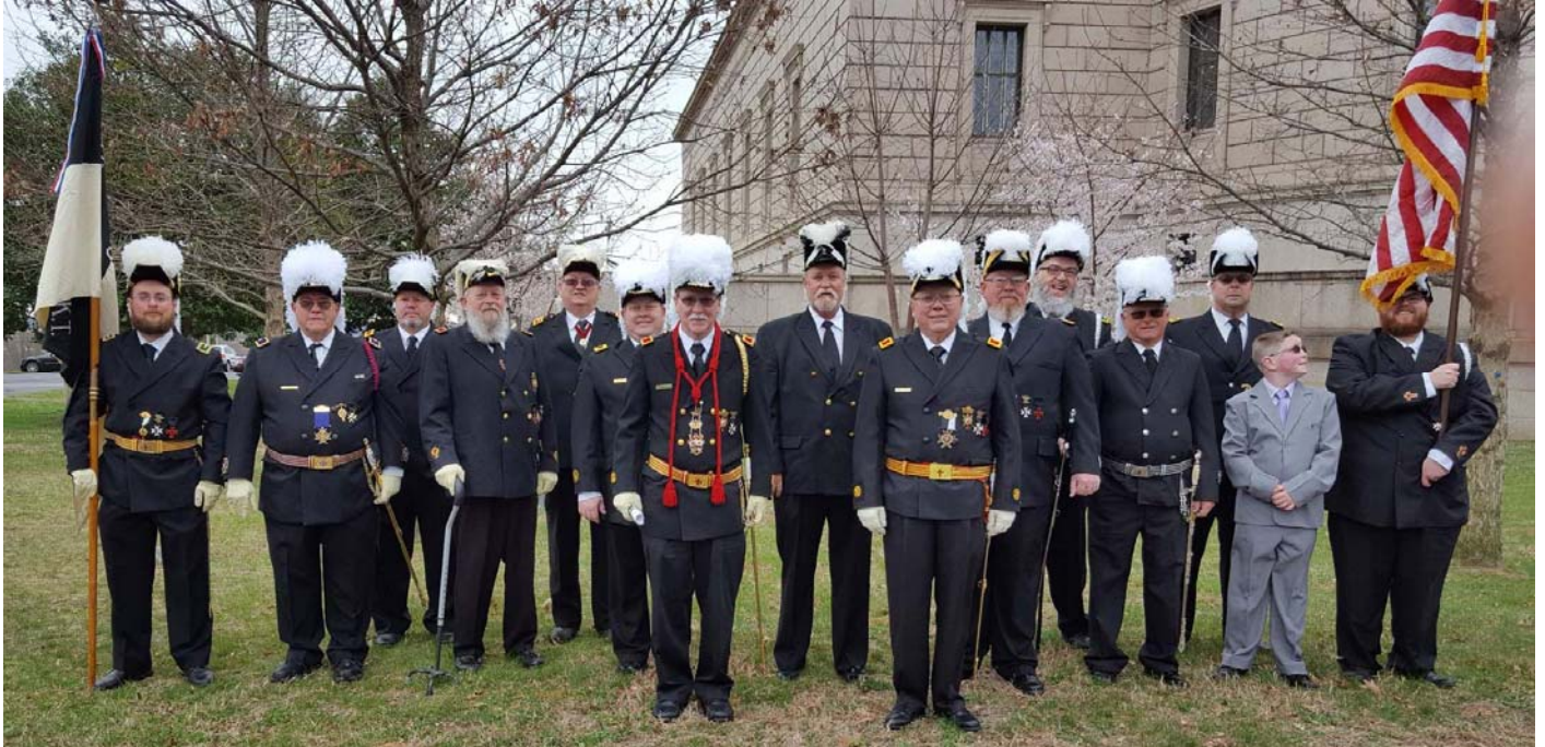
Grand Commandery of Kentucky at the 2018 Easter Sunrise Service