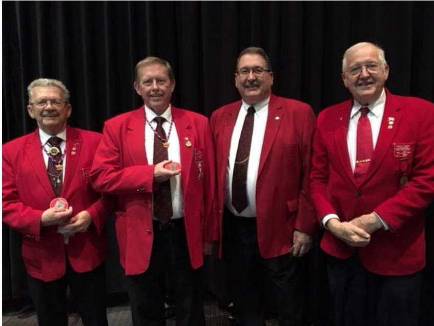
Kentucky's Grand Chapter elected officers following graduation from the Emerging Leaders Program at the 2018 Department Conference

ANY York Rite member is eligible to attend this training, including Blue Lodge members who are not active York Rite Masons. Registration for the Conference is required. Classroom space is limited to 75 attendees in each of the first two courses at the Fort Wayne Conference, and to 50 for the 401 course. Registration by February 12 will get the special room rate of $114. Those who have completed the program are encouraged to return for Level 4.