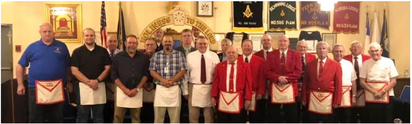
Past Master and Most Excellent Master at Iroquois Chapter #193, July 24, 2019.