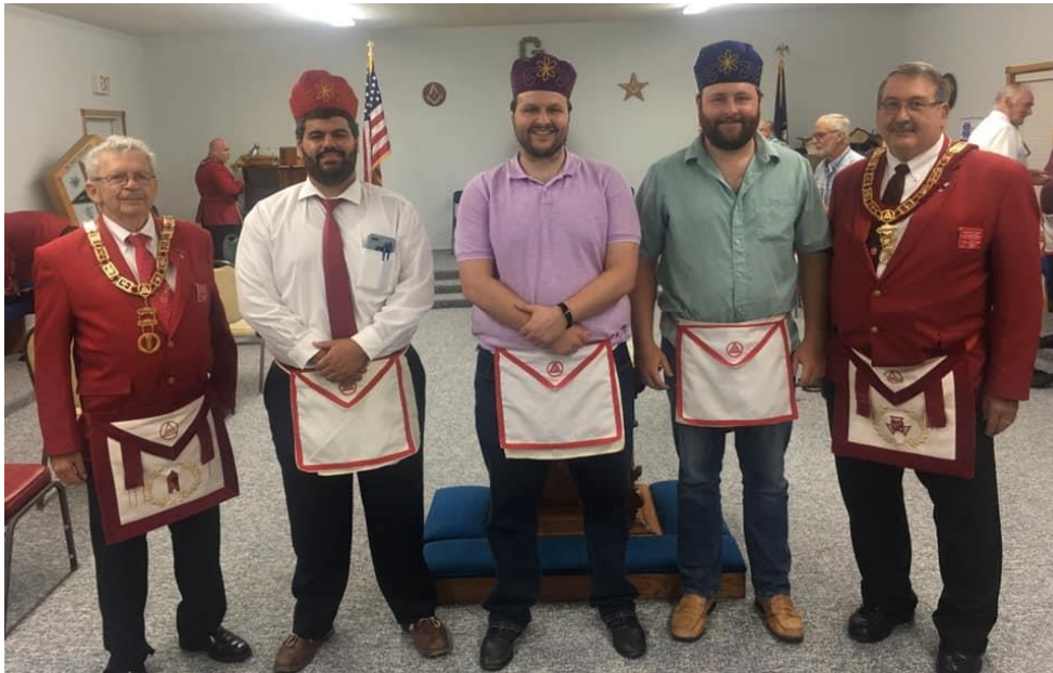
Monticello Chapter Royal Arch Degree July 23, 2019