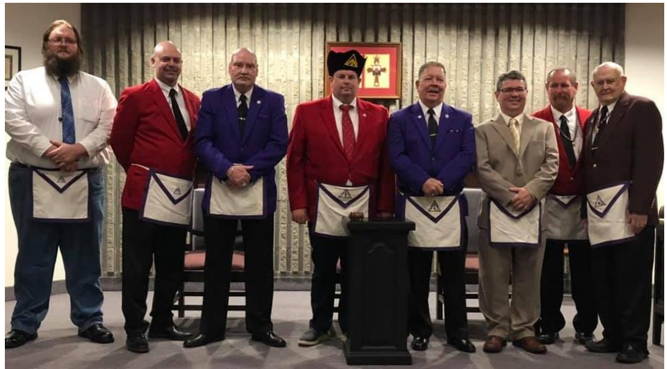
2019 Officer Installation Louisville DeMolay No 12, KT