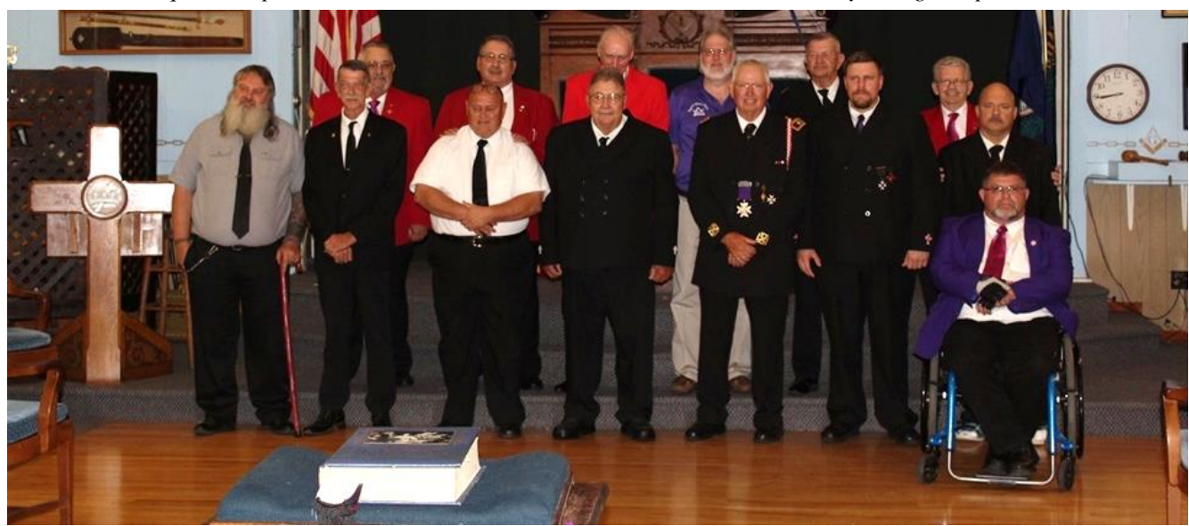
Installation of Officers at Danville York Rite