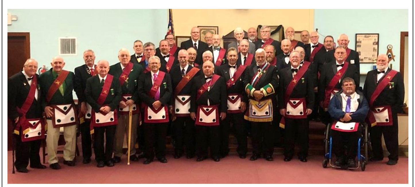
Kentucke Council 71, Knight Masons, June 22, 2019, Bardstown, KY