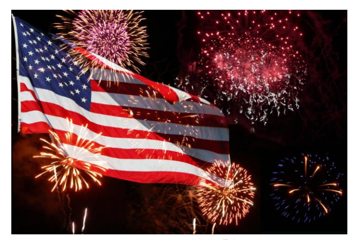
... Conceived in Liberty