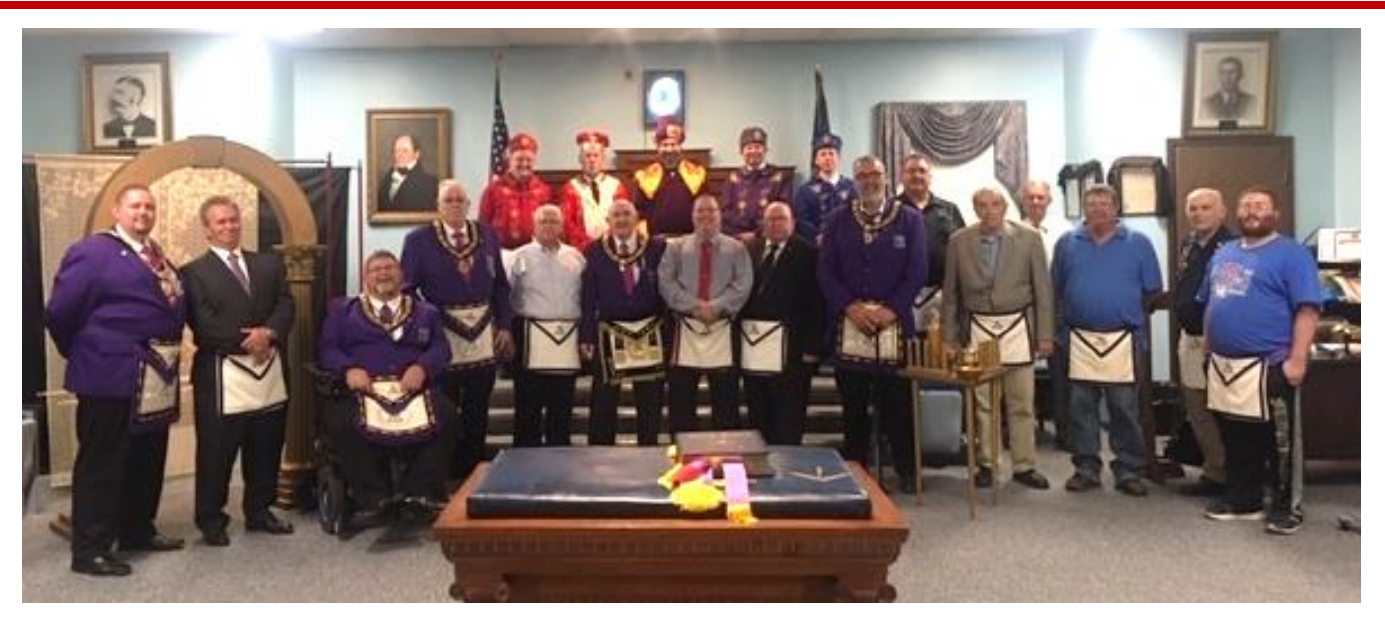
Richmond Chapter and Council Installation and conferral of the Council degrees, July 2, 2019.