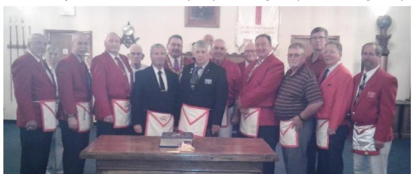
Iroquois Chapter and Council Elections, June 26, 2019.