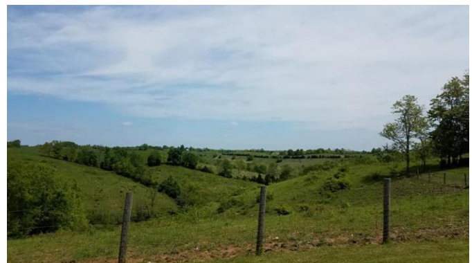
Some of the scenery along HWY 127