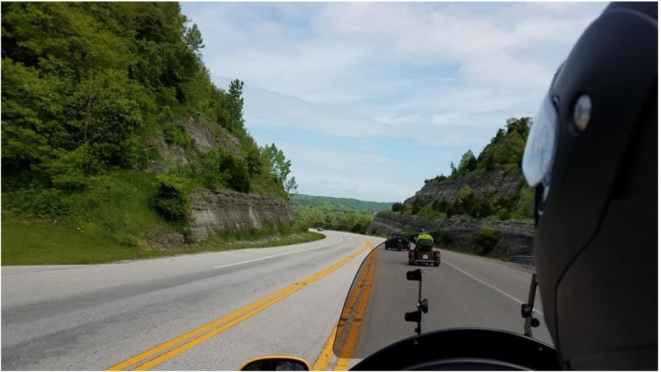
Hwy 227 – over 100 curves in 17 miles