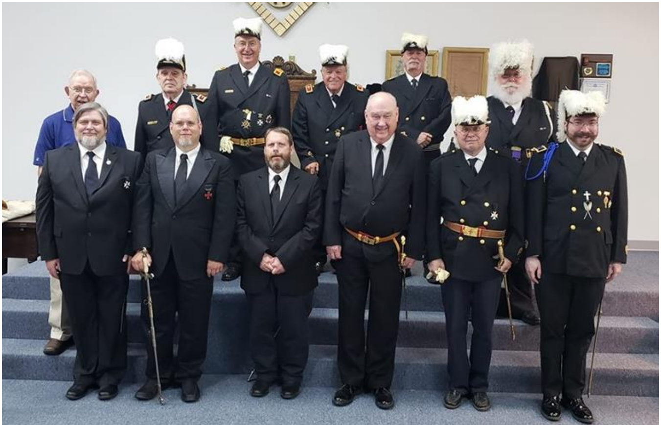
Commandery Inspection, Winchester No. 30.