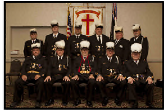
2013-2014 Grand Officers Grand Commandery of Kentucky, Knights Templar