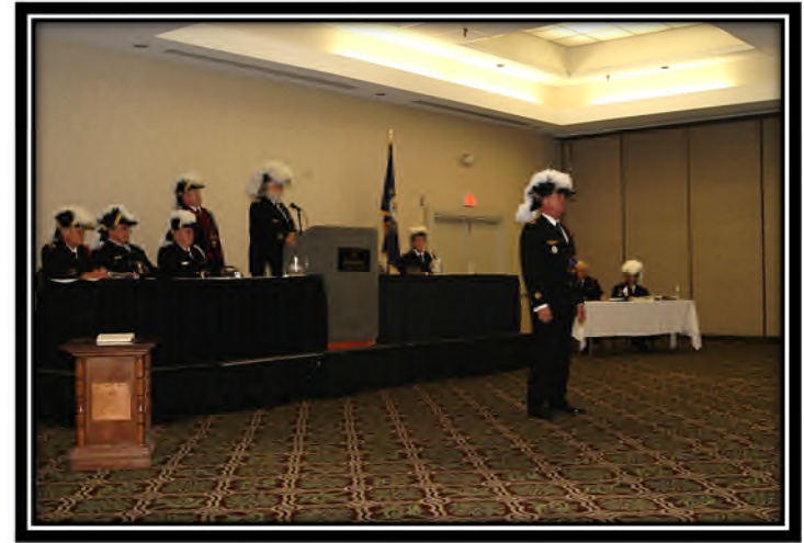
Officers in the East