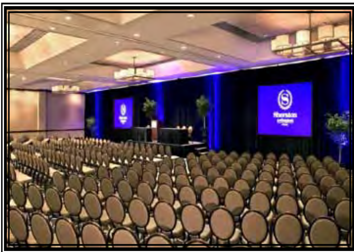
TEXAS TURFGRASS SUMMER CONFERENCE SHERATON HOTEL ARLINGTON, TEXAS JULY 7-9, 2013