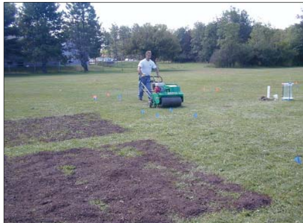
Compost is applied to turf plots in a park to determine the most beneficial application rate.

It may be important for those who sell compost to include a detailed information sheet or label (see table below) that provides sufficient information for end users to make informed purchasing choices. A survey of horticultural users indicated that they were most interested in seeing information on pH and NPK content followed by organic matter and carbon to nitrogen ratio. Other parameters of interest are feedstocks, maturity, density and conductivity (salinity). Since compost characteristics may change over time and with the feedstocks used, we propose testing composts be analyzed for at least the above parameters whenever a batch is completed as well as when feedstocks change. We further propose that the results of the last three tests, along with the average value be included in an information sheet or on a label along with the feedstocks used to create the compost.