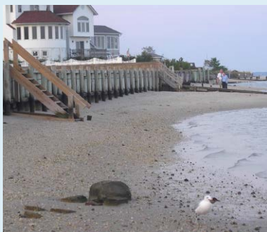
Bird feeding on invertebrates that inhabit a tidal beach vulnerable to rising sea level along Peconic Bay in Riverhead.

sea. Those beaches provide nesting sites for horseshoe crabs, which are a key source of food during spring for migrating shorebirds, such as the endangered red knot. Other shorebirds feed on these beaches throughout the year. Vulnerable tidal flats provide habitat for soft clam, hard clam, bay scallop, and blue mussel.