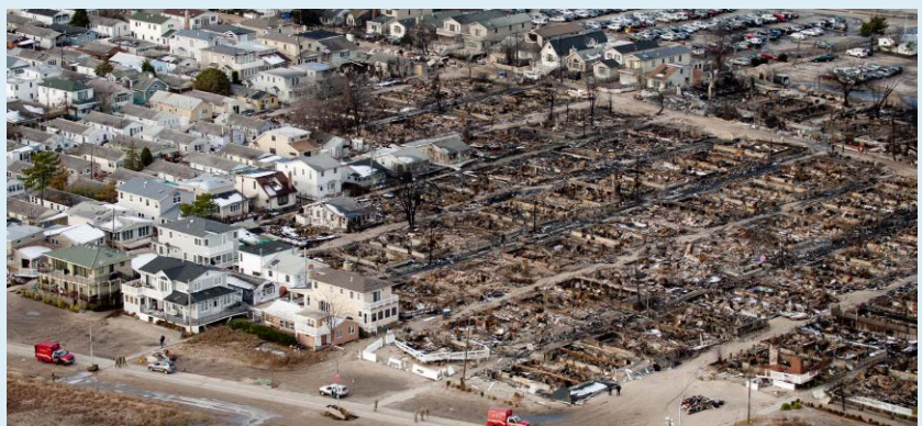
Breezy Point, Queens, in the aftermath of an electrical fire ignited by floodwaters during Hurricane Sandy.

Rising sea level increases the vulnerability of coastal homes and infrastructure to flooding because storm surges become higher as well. Although hurricanes are rare, much of the infrastructure in the New York metropolitan area is vulnerable to flooding. In 2012, high waters during Hurricane Sandy flooded Amtrak, PATH, and subway tunnels, as well as electrical substations, wastewater treatment plants, telecommunication facilities, hospitals, and nursing homes. Wind speeds and rainfall rates during hurricanes and tropical storms are likely to increase as the climate warms. Rising sea level is likely to increase flood insurance premiums, while more frequent storms could increase the deductible for wind damage in homeowner insurance policies.