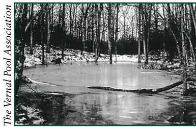
The Vernal Pool Association

Many vernal pools fill with water in fall or spring.