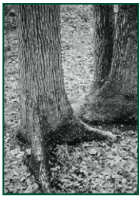
Trees found in swamps are sometimes buttressed at the base, which helps anchor them in the saturated soils.

SWAMPS are fed primarily by surface water inputs and are dominated by trees and shrubs. Swamps occur in either freshwater or saltwater floodplains. They are characterized by very wet soils during the growing season and standing water during certain times of the year. Well-known swamps include Georgia's Okefenokee Swamp and Virginia's Great Dismal Swamp. Swamps are classified as forested, shrub, or mangrove.