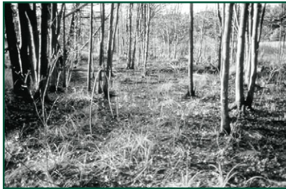
Forested swamps serve a critical role in the watershed by reducing the risk and severity of flooding to downstream areas.

Forested swamps are found in broad floodplains of the northeast, southeast, and south-central United States and receive floodwater from nearby rivers and streams. Common deciduous trees found in these areas include bald cypress, water tupelo, swamp white oak, and red maple.