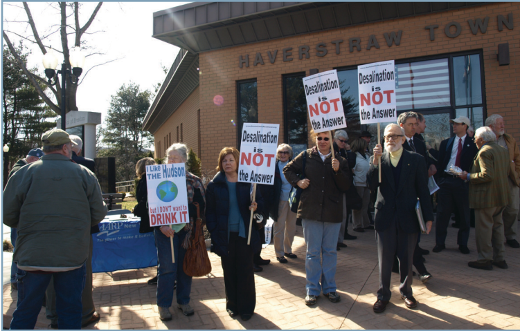
Protestors outside public hearing on proposed desalination plant, Haverstraw Town Hall, March 6, 2012.

through conservation as possible, the town observed further “The potential for conservation measures to reduce water usage and to reduce the need for any new water supply is obvious” (Town of Orangetown, 2010). Clarkstown sought a neutral third party assessment of the underlying assumptions of the EIS, argued for the potential of further conservation measures and undertook to consider a local law to this end (Town of Clarkstown, 2010).