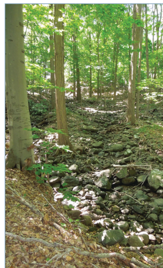
Roaring Brook (dry stream bed). During dry periods in our region, the primary source of stream flow in many streams is groundwater that reaches surface streams after it flows laterally through the subsoil, known as base flow. Smaller streams can dry up earlier in the summer when the water table is lowered, and the USGS study of Rockland County's water resources found this happening in some locations due to pumping from United Water's wells. This photo shows Roaring Brook, a tributary of Sparkill Creek that drains into the Hudson in, during a dry spell in early July 2012.

In 1991, in response to the NYS PSC, Rockland's water supply company (then still the SVWC) commissioned a study to determine whether conservation could postpone