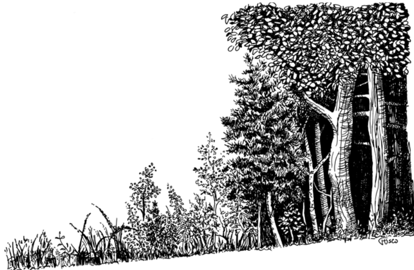
Figure 1. The grasslands, shrublands and young forest habitats may be referred to as “early-successional habitats.” In this graphic showing the time sequence of plant succession, early-successional habitat would continue through 20+ years, fading out sometime during the 25- to 100-year phase.