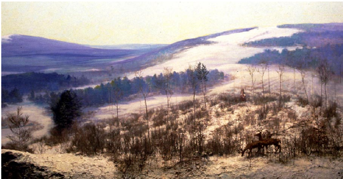
Figure 3. Farm abandonment, 1850, as depicted in the Harvard Forest dioramas, showing New England land use history. Used with permission of Harvard University Press. Photo by John Green.

Increasing numbers of colonists expanded agriculture more intensively in coastal regions, as well as further inland from the 1700s through most of the 1800s. Many grassland wildlife populations increased their numbers at this time, and even extended their ranges further inland. However, due to land clearing, shrubland and young forest habitat actually declined in the Northeast during this time period, and the wildlife associated with those habitats declined along with them (Figure 3).