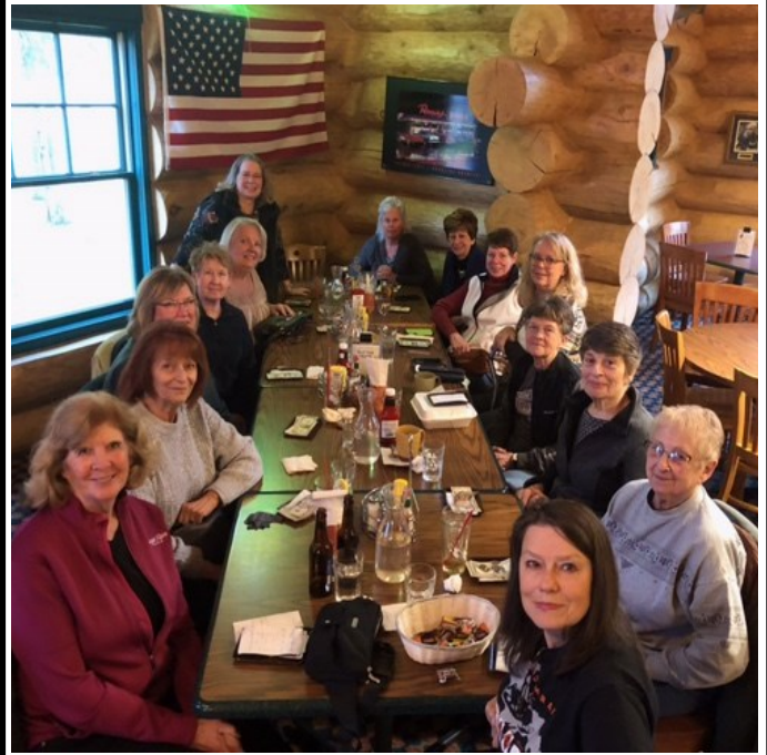
Above: the ladies enjoying the kick-off luncheon for the 2021 season.

We look forward to seeing everyone on November 3 rd !