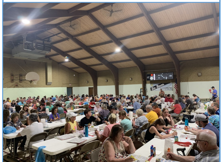
Above: The warm weather didn't stop a large crowd from gathering for Bingo on June 20.

Please contact Roxanne Platz if you have questions, or are available to help (262-370-7767 or greg.platz@att.net ).