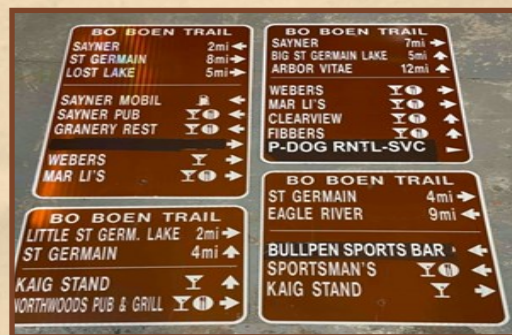
ALUMINUM INFO SIGNS (40 AVAILABLE)

Our groomer barn is in the St. Germain Community Park area, behind the Fire Station. We hope you can come by to claim a piece of Bo-Boen's history and proudly display these cherished keepsakes at your home or business. You can also check out your awesome groomer barn that is ground zero for all that we do as a club.