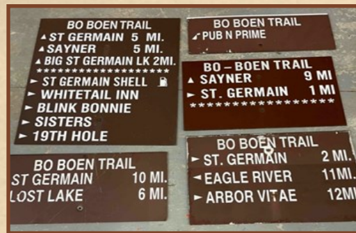
OLD INFO SIGNS (44 AVAILABLE)