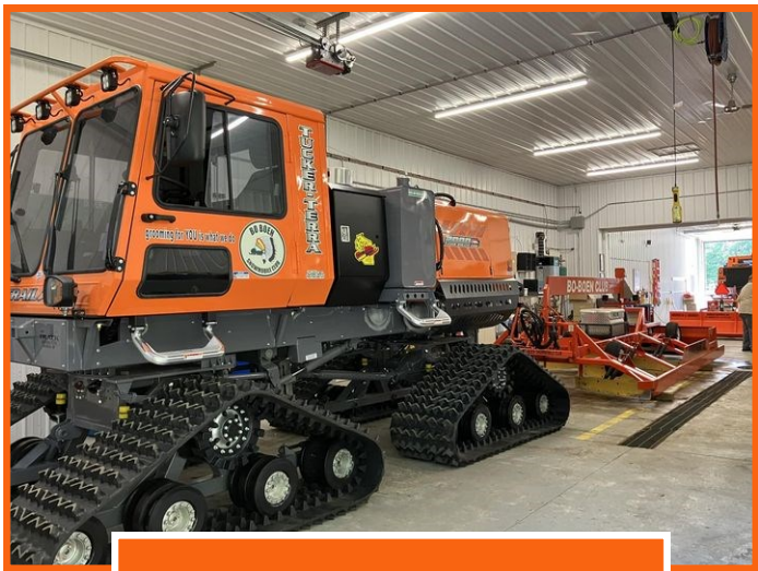
Our new 2023 Tucker has arrived!