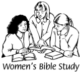
Women's Bible Study

Ladies Bible Study will meet on Wednesday, November 20 at 7:00 pm. at Meadows on Main in the activity room. Lesson 2. We will be meeting the first and third Wednesday during November & December.