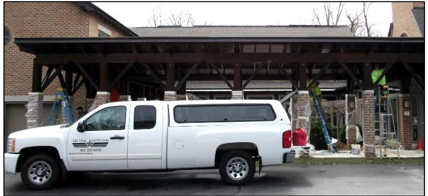
Tri-Star Contractors repairing the wood in the Courtyard