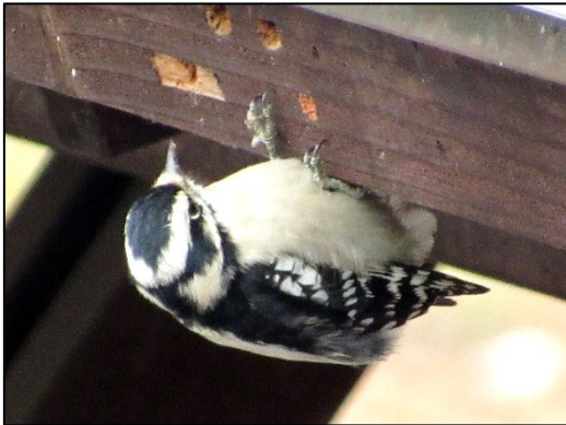
Downy Woodpecker causing damage in Courtyard