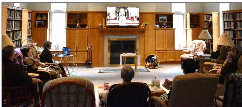
Easter Sunday Mass via livestreaming in our community room

In our Easter letter, we rejoiced that so many family, friends and benefactors were able to join us for our Christmas Eve Mass and refreshments. We were truly filled to capacity! Then, in mid-March, while we were still on our Lenten journey, we went on "lockdown," and our lives changed. Our Sunday Masses, including Palm Sunday, Easter Triduum services, and Easter Sunday Mass, were all via livestream with our friars at the Church of the Transfiguration in Southfield, Michigan. We are grateful for the ability to livestream in our community room. We were able to join Pope Francis on March 27 as he prayed before the empty Square of St. Peter's Basilica, and on May 30 for the recitation of the Holy Rosary.