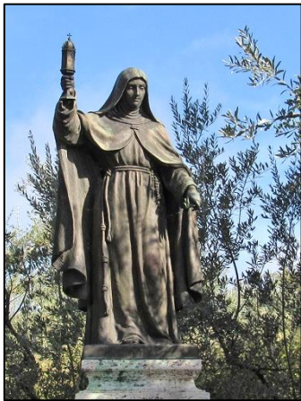
Statue of St. Clare outside San Damiano