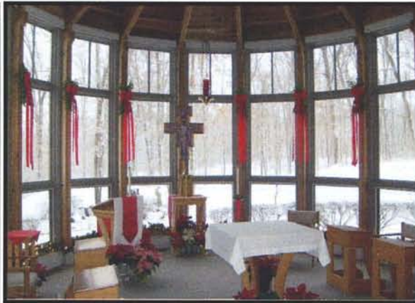
Our Chapel (first snow) during Christmas Season