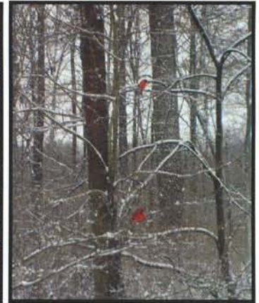
Cardinals lining up at the bird feeder