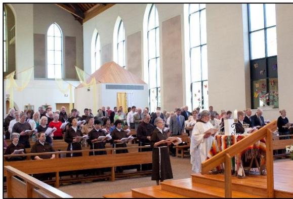
Solemn Profession of Vows Mass on April 26, 2014 St. Clement Church, Cincinnati, Ohio