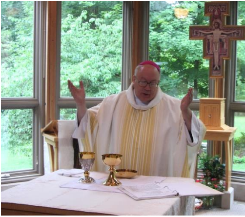
Bishop Joseph Binzer