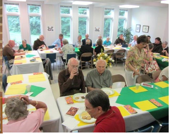
Guests gather at the meeting room for light luncheon on the Feast of St. Clare