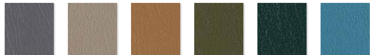
Cadet 518766 Pumice 518634 Bucksuede 518636 Everglade 518773 Hunter Green 518779 Horizon Blue 518635