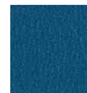
Colonial Blue 518769