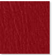
Candy Apple 518767