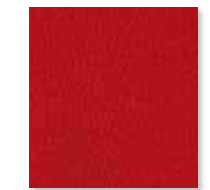
American Beauty 520202