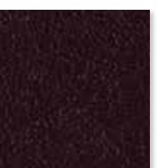
Black Plum 517421