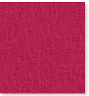
Very Berry 523027