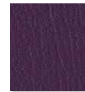
Purple Iris 517919