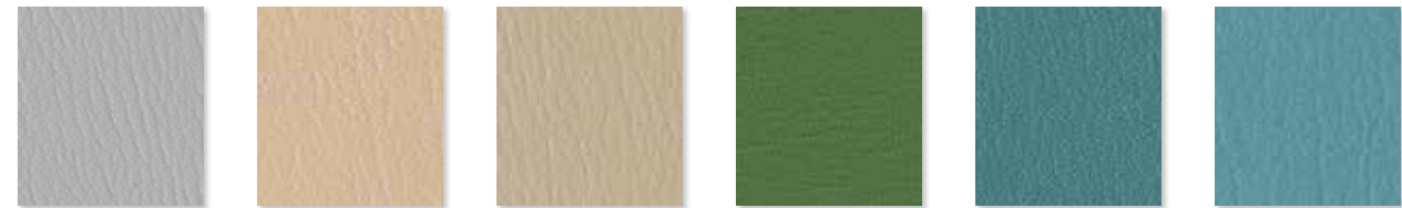
Lite Gray 518781 Natural 517908 Beige 518424 Grass 532618 Jade 518421 Light Teal 518420