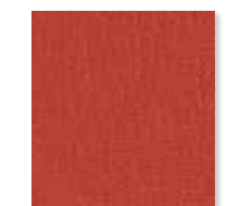
Red Cent 518795