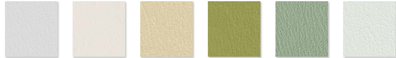
Snow 517918 White 518802 Wheat 532614 Leapfrog 518780 Seafoam 518418 Reflection 532612