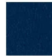
Midnight Blue 518785