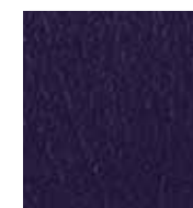
New Purple 520053