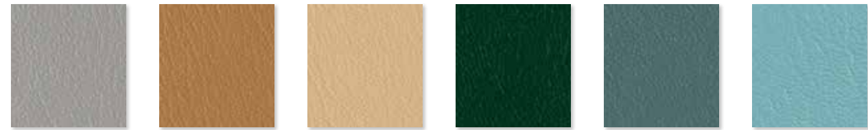
Gray 517423 Saddle Tan 517730 Coffee Cream 518768 Emerald 518772 Sea Grass 518419 Aqua 532616