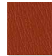
Deep Clay 518771