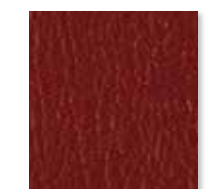
New Burgundy 518787