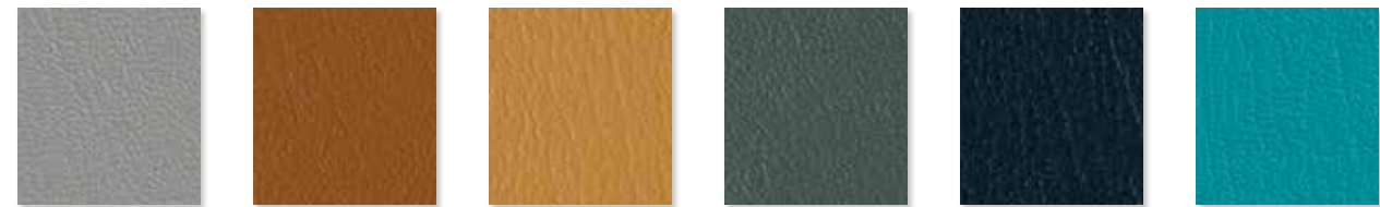
Gris 532615 Outback 518790 Camelback 518423 Vizcaya Palm 518386 Spruce 518417 Blue Nile 518762