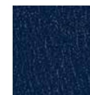
Royal Blue 518796