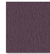
Wood Violet 518804