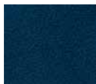
Colonial Blue 519251