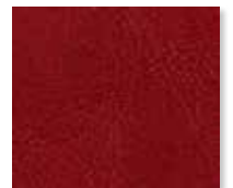
Fire Red 518382